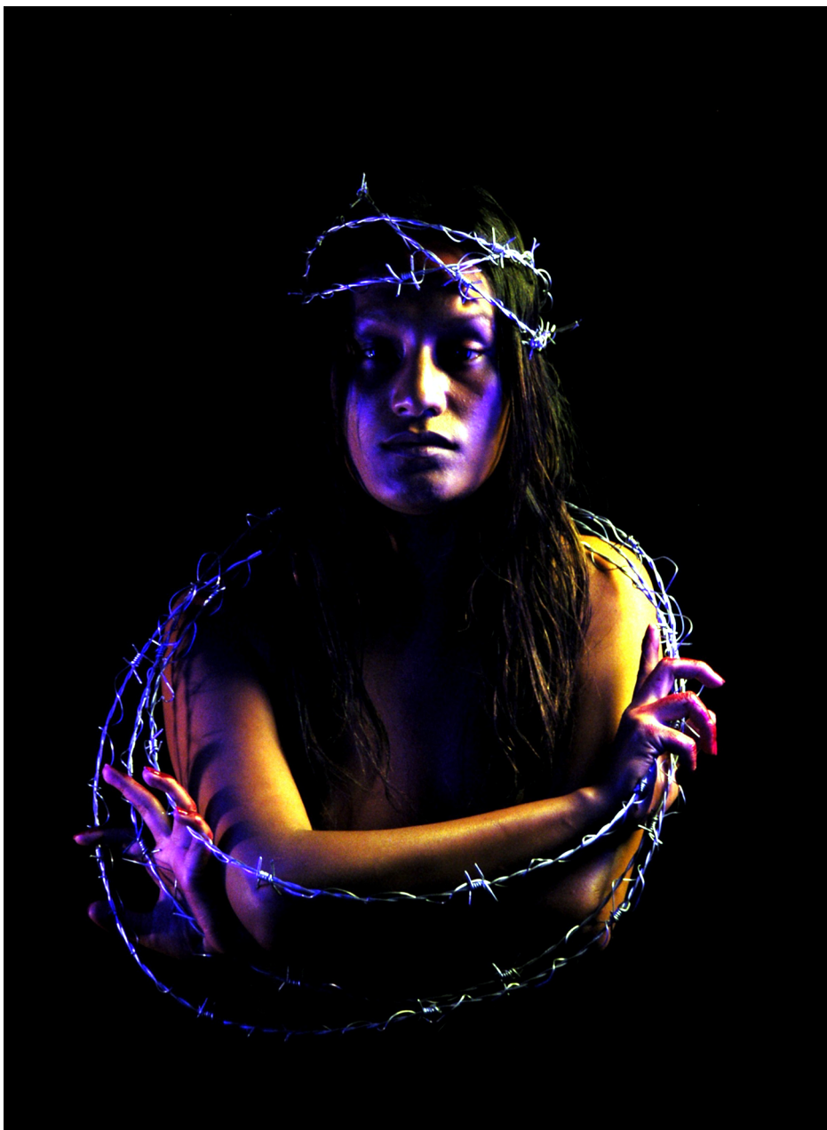
Iesu Keriso: Jesus Christ C-type photograph and mixed media, 100 cm x 80 cm