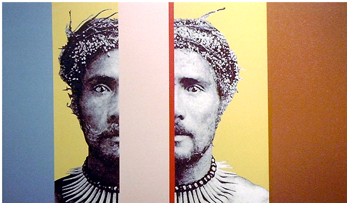
Afa Tasi; Half of one Ink jet on canvas and mixed media, 2002, 60 cm x 80 cm