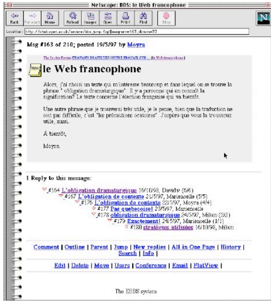
Figure 7. A thread supporting a reflective conversation

Looking at a segment of the thread in Figure 8 , we see the collaborative narrative unfold from a student's (M.) request for help with the meaning of obligation dramaturgique , a phrase which is not lexicalized and therefore requires sensitive decoding taking into account the context. The first person to come to her aid (D.) alerts her to the importance of context and offers two possible solutions. After a clarification by M., helper Mk. offers a different approach: he uses an analogy derived from personal experience in order to illustrate the phrase and offer a translation. Both helpers in turn became teachers (or experts) with very different teaching styles. The original inquirer learned something from the responses she received and was appreciative of their quality (as she made explicit in a follow-up message). She later returned the favor by helping out another student with a thorny translation problem. Her friends' productiveness, and eventually her own, occurs as part of a social interaction in which learners take turns at being experts for each other. The interaction is characterized by the negotiation of understanding, a focus on linguistic form, contingency, and communicative symmetry.