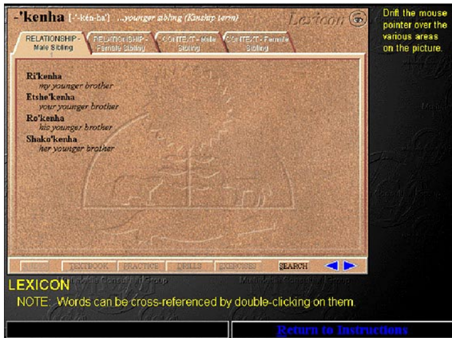
Figure 3. Lexicon module

The Lexicon module (see Figure 3) consists of a dictionary of 250 entries listed thematically, and also contains a search engine. Each entry in the lexicon is accompanied by a sound file of the Mohawk pronunciation.