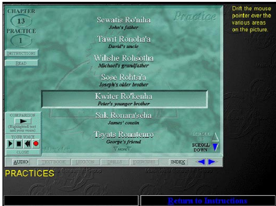
Figure 4. Practice module

The Practice module (see Figure 4), allows one to hear Mohawk, record one's own pronunciation of Mohawk (with the appropriate hardware), and compare it to that of a Mohawk speaker. (David Kanatawakhon's voice is used for all audio files.) As a method of feedback, this is great, if the user is the type of person who can hear Mohawk reliably and self-diagnose his or her own pronunciation.