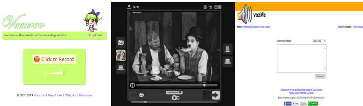
Figure 1. Online self-study resources, Vocaroo, vozMe, and VoiceThread with a silent movie clip.

The participants voluntarily emailed their recorded links once or twice a week using Vocaroo to the instructor to receive feedback. Through these exchanges, the instructor was able to assess participants’ learning progress, and participants were able to keep track of their learning history during the research period. The instructor did not require that they submit their individual work, but instead encouraged them to engage in self-study and mediated the process of using self-study resources via email exchanged.