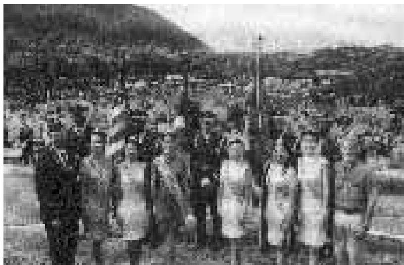
The Honolulu Mayor, the Narcissus Queen and her court, and Miss Chinatown USA join in the services

Membership: The members are made up of returning veterans and their family members, who pay annual dues of $26.