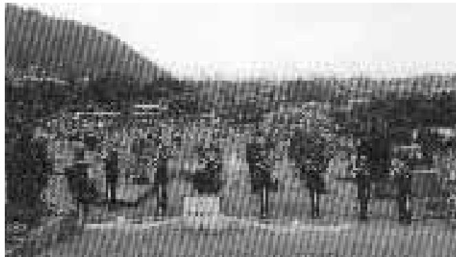
Honor guard on Memorial Day.