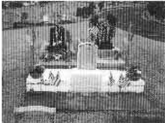
Tomb of the Seven Unknown Chinese Heroes.