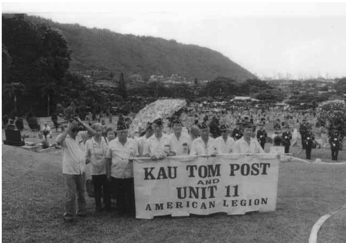
Members at Memorial Day services at the Manoa Chinese Cemetery.

Since then, the members of the Post and Unit have worked together in close harmony and cooperation.