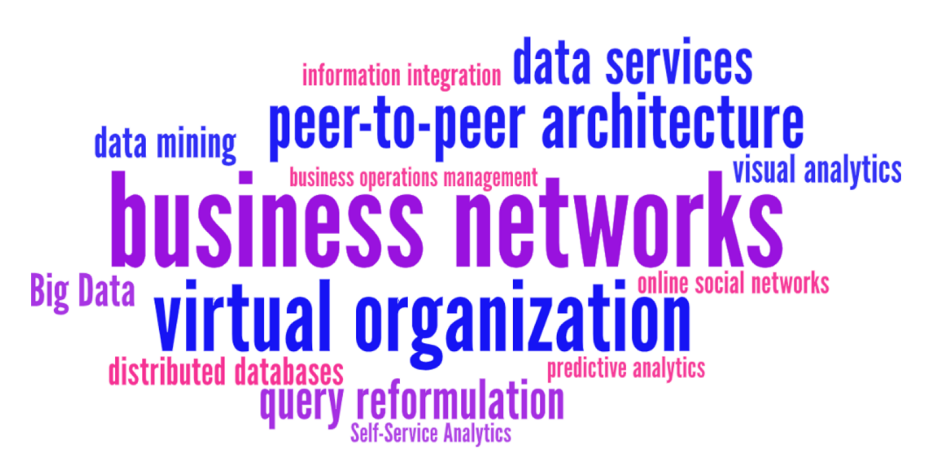
Figure 2. Foundational Ontology for the Collaborative Business Intelligence.

this architecture differs from a traditional BI system in two aspects. First, it is based on the integration of heterogenous semantic concepts to build upper ontologies comprising general terms that are common across all domains. Second, source data retrieval in terms of low coupling and abstraction is achieved by following Service Oriented Architecture (SOA) procedures.