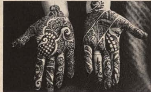
Mehendi Ceremony, day two of the four-day Punjabi Wedding, Kolkata