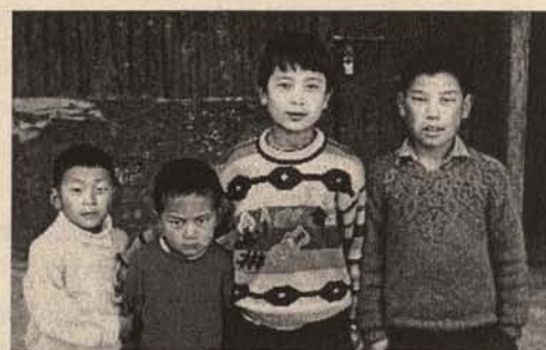
Boys at school, Tibetan Refugees Self-Help Centre, Darjeeling