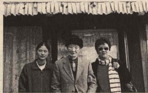
Outside what was "Park Restaurant" (1954-1962) before Chinese Internment, Darjeeling