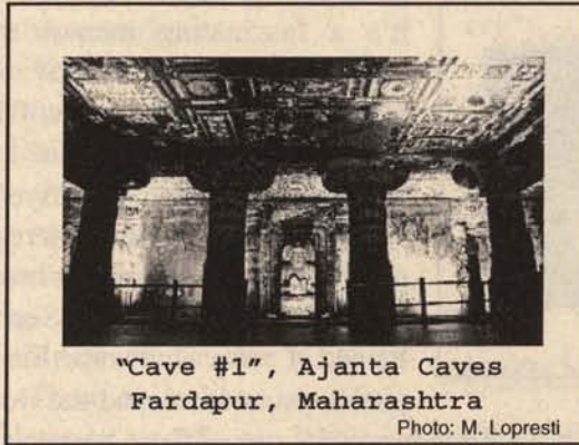
"Cave #1", Ajanta Caves Fardapur, Maharashtra