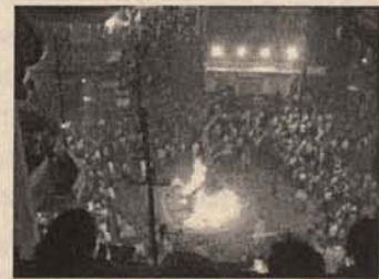
The Holi is set aflame.

That which troubles and eludes you is deeply entwined with the richness of human culture in all of its massive facticity. You have come to understand and engage with India but the task overwhelms you, for this 'India' that you covet spans dizzying landscapes of meaning, from the tangible physicality of climate to the vast sweep of human activity: religion and politics and warfare and agriculture and art and architecture and so on. Hundreds of millions of people implicated in vast networks of cultural practice constructed upon on layers of complex historical fact: