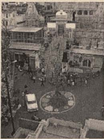
Holi in front of the Jagdish Mandir in Udaipur, Rajasthan.

H industan kaise hai (How is India)? The question is deceptively simple, the answers predictably flaccid, propped up by the interpretive crutch of cliché.