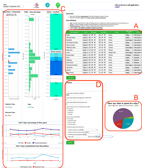
Figure 1: LifeLogger user interface. Participants were asked to import data streams from RescueTime, Fitbit and Moves, which would show detailed breakdowns of their their automatically collected data (C). Part C acts as an activity recorder prompt which helps participants answer a daily survey (A & D). Results from Part A will appear in the form of a pie chart (Part B). At the bottom of Part C, there are 2 aggregated 7 day data summaries; the first is generated from Part B. Below that, we displayed the participant's weekly RescueTime usage in the form of a line graph. *Note: Data shown in this example is fictitious and does not represent data from our participant.