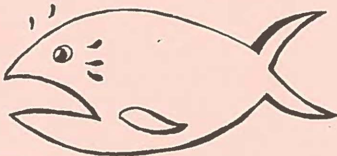
(the State & U. H. Regents)

COFFEE WILL BE SERVED AT ALL GENERAL MEETINGS