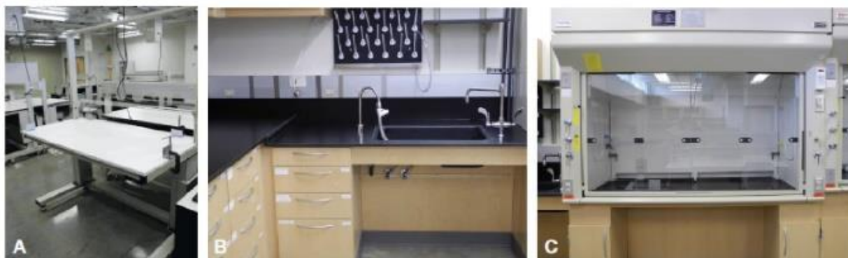
Figure 4 Image Description: Three photos of wet laboratory work triangle with (A) Automatic adjustable height lab bench, (B) Wheelchair-accessible lab sink, and (C) Wheelchair-accessible fume hood (AAAS, 2014).