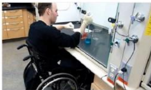
Figure 3 Image Description: Photo of a wheelchair user in a wheelchair-accessible fume hood in research laboratory (AAAS, 2014).