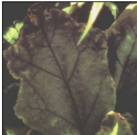
Eggplant leaves with hopperburn

For okra, scientists in India have found that the greatest yield return to the costs of spraying are obtained by protecting the crop between 45 and 75 days after planting.