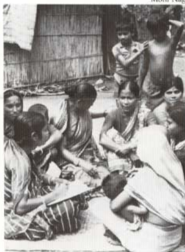
The Extension Project provides evidence that national programs can absorb many of the successful elements of pilot family planning programs.

Women who are interested in adopting a family planning method are provided a choice of pills, condoms, foam tablets, or the injectable contraceptive DMPA. Women who express interest in IUD services are encouraged to visit a nearby clinic,