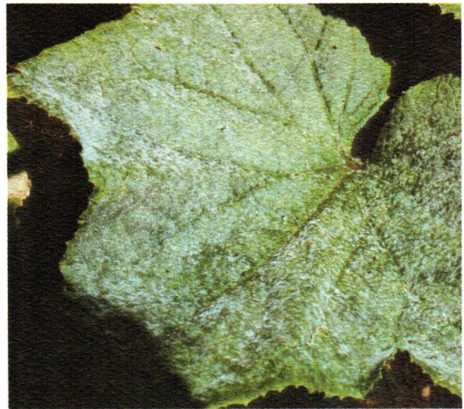
Figure 2. Powdery mildew on cucumber.

Cucumbers do best in soils that are well drained and high in organic matter. Apply 5 tons/acre chicken manure or 8 to 10 tons/acre steer manure.