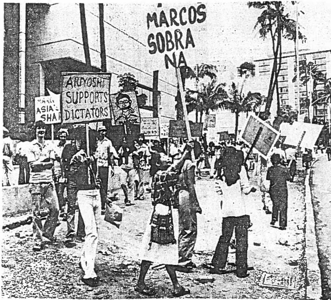
More than 150 marched in the April 21 picket at the Sheraton Hotel that was sponsored by the Committee to Protest the Marcos Visit which was initiated by the Union of Democratic Filipinos(KDP), The Committee for Human Rights in the Philippines(CHRP), and the Friends of the Filipino People.