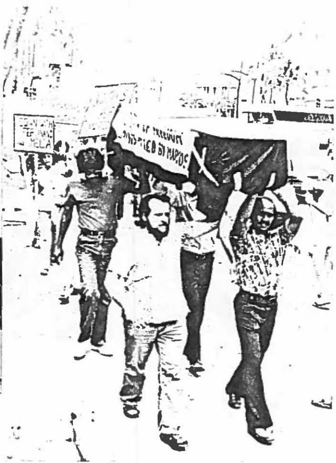
Philippine consulate provided life size photos of Imelda and Ferdy. Demonstrators carry coffin to mourn the death of Freedom in R.P.