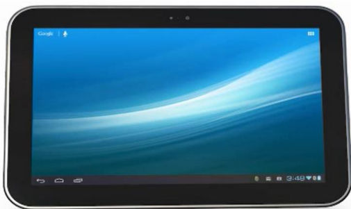
Figure 2. Graphic design of tablet in control condition

For the auditory manipulation, a human voice was recorded by a professional male voice actor following a written script. The voices in the auditory manipulation treatments were recorded as a first person to have direct communication with the viewers. A pilot study was conducted to select the best voice design. For the no-auditory manipulation, the script was presented in text subtitles below video.