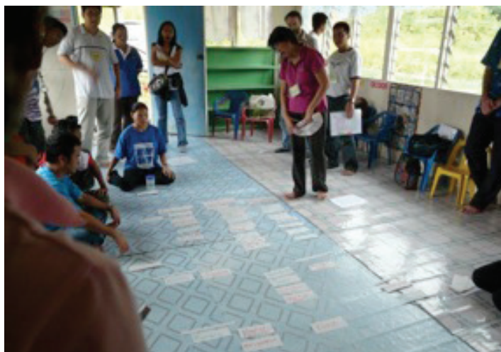
FIGURE 3. A Domains Venn Diagram facilitation conducted by another group of researchers with Dusun and Kadazan speakers in Sabah, Malaysia.

3.2.3 IMPLICATIONS AND APPLICATIONS. The pilot tests suggest that the Domains Venn Diagram can be used to investigate the languages spoken within a community, attitudes of the community toward the heritage language, and the vitality of the heritage language. The tool provides a means for various individuals to discuss their perceptions of language use in their community together and results in a visual representation of the group's assessment, and can thus help the language community form a clearer picture of their language use and raise awareness of language vitality issues if heritage language use is in decline. The discussion following the diagram's creation encourages members of the community to think about their heritage language and helps them to consider whether they want to make any change in the language situation that is laid out through the diagram. This facilitation can be particularly helpful in starting a conversation with the community about strategies for promoting revitalization and maintenance of the heritage language. In those cases, the discussion could then be directed towards selecting the domains which community members would like to target for language documentation or conservation.