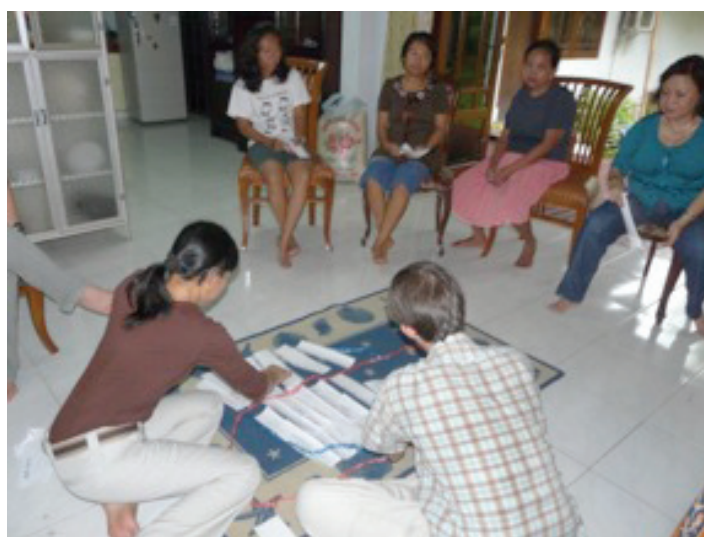
FIGURE 4. Javanese speakers in Depok, West Java creating a Bilingualism Venn Diagram.

be used, the facilitator asks the group to name the languages spoken in their community, including the heritage language and the most prevalently used language of wider communication (LWC). The group is asked to name descriptors for groups of people that speak the heritage language well. They are then asked to name descriptors for groups of people that speak the LWC well. Examples of descriptors include age group, geographic location, urban/rural, level of education, kinship, gender, occupation, location by political unit, and religious affiliation. The participants are encouraged to create descriptors that are meaningful and appropriate in their context, and the facilitator should draw out participants' ideas and help them brainstorm a large number of descriptors. Each descriptor is written or represented with a picture on a slip of paper that is placed in the center of the group for all to see.