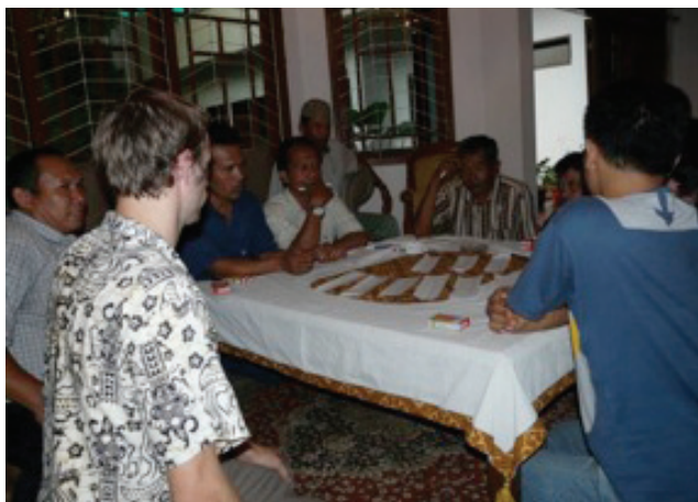
FIGURE 2. Speakers in Depok, West Java, Indonesia creating a participatory dialect map of Betawi.

prompt, emphasizing that the language varieties included should be related closely enough that native speakers of the local language are able to understand at least some of what is said in those varieties.