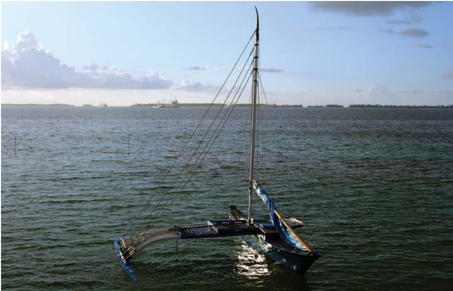
FIGURE 1. Thirty-six-foot voyaging canoe Jitdam Kapeel anchored in Majuro Lagoon.

Using the canoe as a metaphor for island histories, communities throughout Oceania are navigating through unknown routes to recover highly specialized and especially powerful knowledge that has been lost, forgotten, and fragmented (DeLisle and Diaz 1997). Emerging revitalization projects aim to document and preserve this knowledge in ways that are appropriate, respectful, and beneficial to the communities and individuals that possess that knowledge. However, such cultural preservation projects face a central paradox—the process of revitalization recontextualizes the knowledge and this weakens its cultural significance (Krauss 1992). Avoiding this requires navigating complex and competing claims regarding who the legitimate holders of knowledge are, how the knowledge is properly used and transmitted, how the exclusive retention of the knowledge sustains the personal status and authority of the specialist, and how specialists' knowledge supports chiefly or supernatural power and authority (Rubinstein 2009).