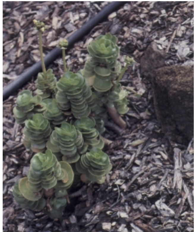
Portulaca molokiniensis forms a rosette of succulent leaves arranged in an imbricate pattern, which gives this specimen plant a highly ornamental appearance.

Portulaca molokiniensis is a recently described species and comes from the offshore islets Molokini and Pu‘ukoa‘e and from Kamōhio Bay, Kaho‘olawe. It was described by State of Hawai‘i forester Robert Hobdy, who did a survey of the flora of the offshore islands of Maui County. It has very succulent, imbricate leaves that give the plant an attractive and interesting appearance. The round, corky stems with their succulent leaves stand more upright than most other portulacas. The plants can reach a height of about 1 foot. The flowers are lemon yellow and are found in clusters at the tips of the stems. When the plant is going to flower, it sends a leafless, flower-bearing stem above the succulent leaves.