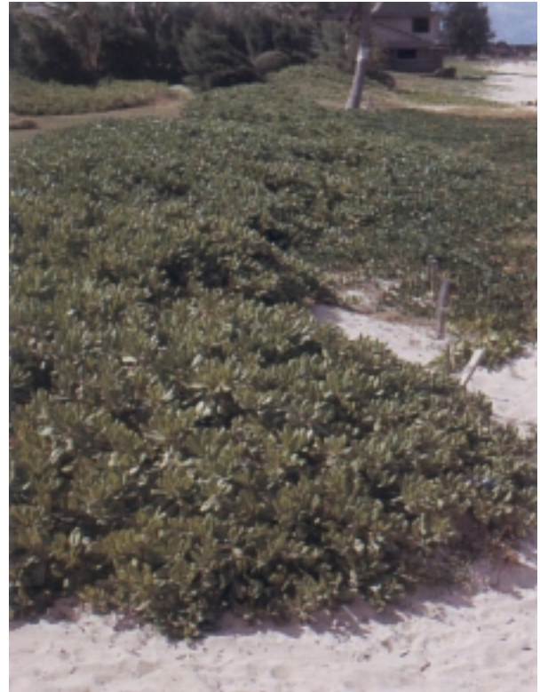
The beach naupaka ( Scaevola sericea ) is an extremely tough and easy-to-grow shrub, ground-shrub, or groundcover that is salt, wind, and drought tolerant.

Propagation. Naupaka kahakai is very easy to grow from seed. Some reports state that the seeds germinate better