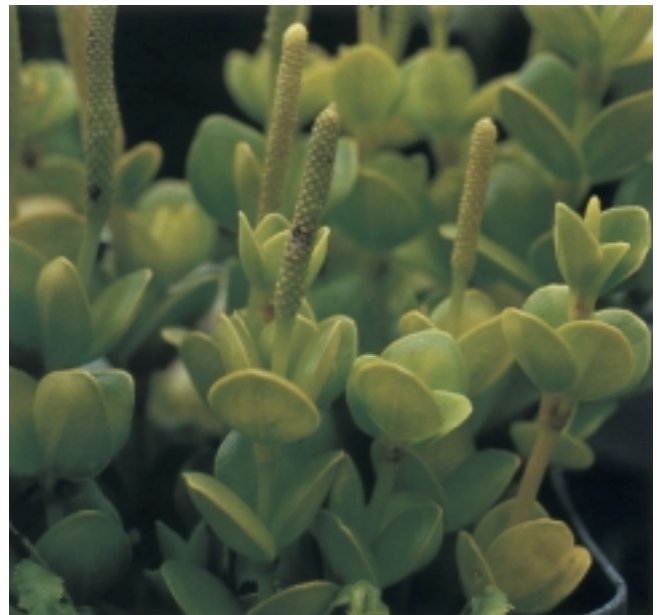
Leaves and flower spikes of ‘ala‘ala wai nui ( Peperomia spp.), a less-thirsty, shade tolerant groundcover or potted plant.

Propagation. Peperomias grow well and easily from cuttings. Either stem or tip cuttings work fine. Make cuttings 3–4 inches long, remove the lower leaves, cut the upper leaves in half, and cut off any flower spikes. Flower growth and seed development takes energy away from the plant. You want to channel this energy into root production. You can plant the seed spikes separately and grow the seedlings too. The cuttings do not seem to need