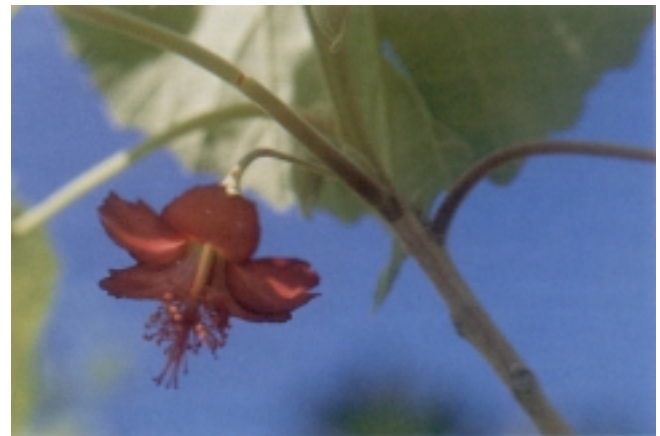
Ko‘oloa ‘ula ( Abutilon menziesii ). Close-up of the flower of this less thirsty shrub.

Description. ‘A‘ali‘i is a shrub or, with time, a small tree. It grows 3–10 feet tall. The leaves are glossy green with reddish midribs and stems. The flowers are either male or female and are fairly small and insignificant (about ¼ inch in diameter). The female flowers develop