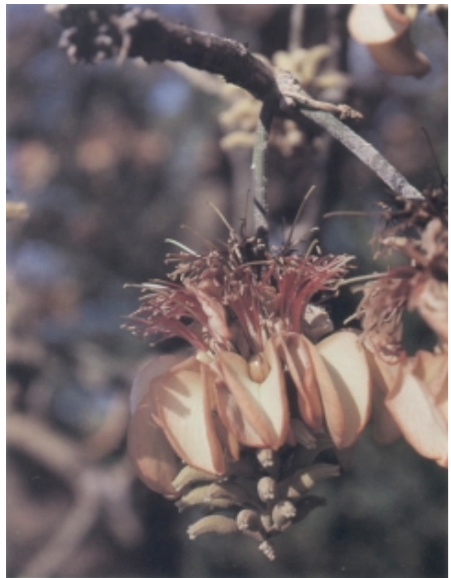
The large, pea-shaped flowers of wiliwili ( Erythrina sandwicensis ) come in a range of pastel colors from chartreuse to apricot.

Propagation. Wiliwili is grown easily and rapidly from seed. Place some of the orange-red seeds in a water-