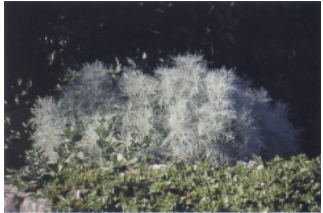
The silvery grey leaves of this shrub or potted plant, ‘āhinahina ( Artemisia australis ), are finely divided. It provides an accent in a dryland garden.

Landscape uses. In the wild, ‘āhinahina grows around boulders or on steep cliff faces. Similar uses can be made of them in the landscape. Plant them around boulders, on well drained slopes, or in large clay or cement pots. They prefer full sun.