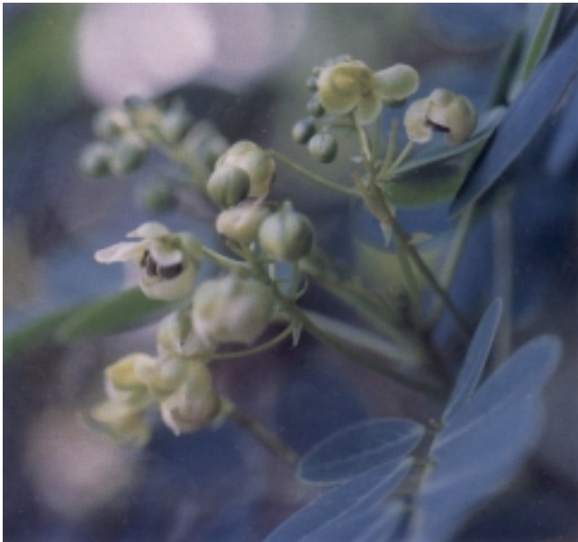
This green-flowered, native shrub, kolomona ( Senna gaudichaudii ), is drought tolerant and can be used as a hedge, specimen planting, or potted plant.

Landscape uses. Kolomona makes an attractive, sprawling shrub for the landscape. It is quite drought tolerant and is a good candidate for the xeriphytic garden. It can also be grown in a large pot and placed in a sunny location. Its close pan-tropical relative, Senna surratensis