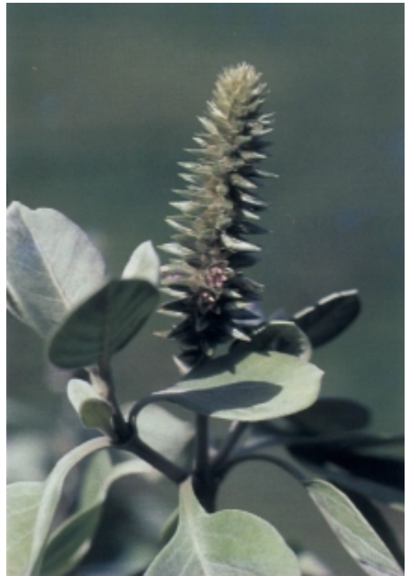
Leaves and flower spike of the very drought tolerant shrub, 'Ewa hinahina ( Achyranthes splendens var. rotundata ).