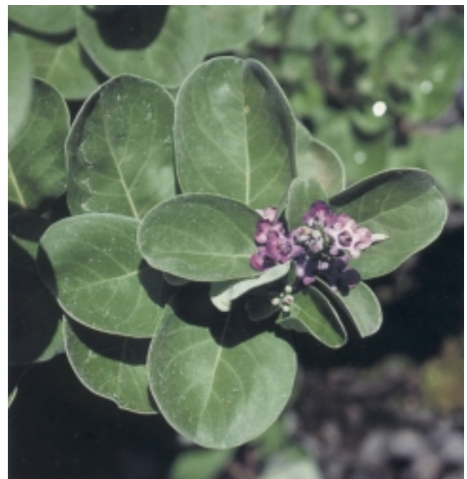
Beach vitex ( Vitex rotundifolia ) is a creeping groundcover with silvery, oval leaves and clusters of lavender flowers.

Description. Pohinahina is a groundcover or sprawling shrub, 6 inches to 2 feet tall. It spreads laterally and grows rapidly once established. It has silvery, oval leaves that sometimes have a tinge of lavender near the margins.