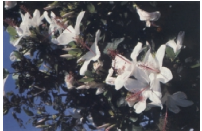
The O'ahu white hibiscus ( Hibiscus arnottianus var. punaluensis ), seen here growing at Moanalua Gardens, has white flowers with a subtle fragrance.