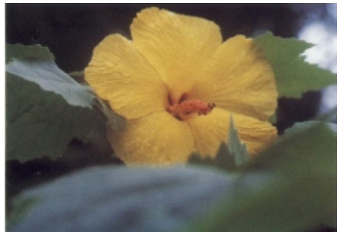
Ma'ō hau hele ( Hibiscus brackenridgei ) is Hawai'i's official state flower. It usually blooms in the spring.

Pests. Chewing and sucking insects sometimes attack