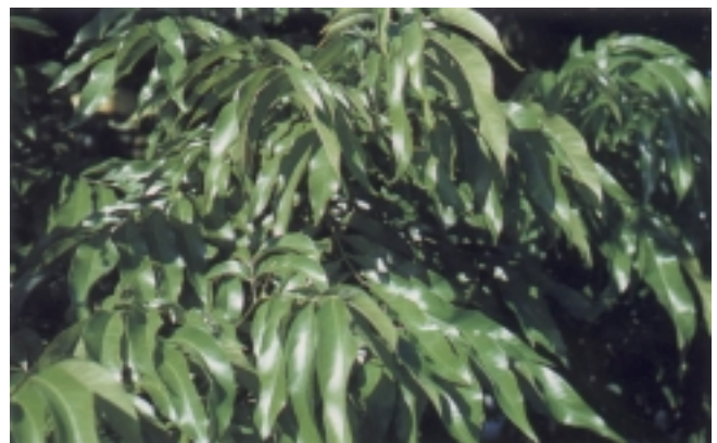
The glossy, pinnate leaves of mānele ( Sapindus saponaria ) are an attractive feature of this medium-sized tree.

Landscape uses. It is attractive when grown in its natural form or pruned into a desired shape. It makes a very