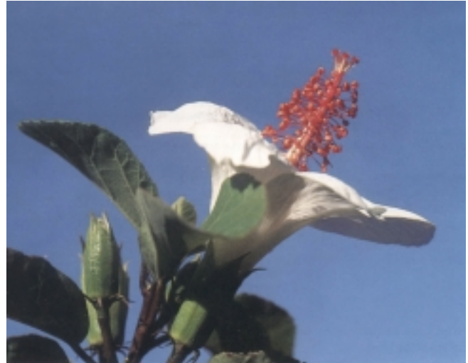
Hibiscus waimeae , koki'o ke'oke'o, a fragrant Hawaiian hibiscus from Kaua'i, is an attractive and unique landscape plant.

Each of these Hawaiian white hibiscuses is unique and possesses a slightly different fragrance. However, their propagation and landscape uses are similar, so they