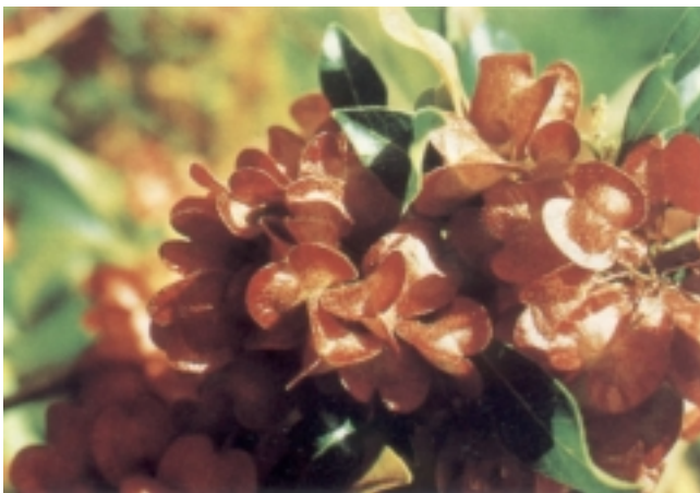
Brilliant red seed capsules of this 'a'ali'i ( Dodonaea viscosa ) can be used in haku lei (worn in the hair) or in fresh or dry flower arrangements.

Other uses. The seed capsules are attractive and are prized for haku lei. Flower arrangers have recently discovered them and use them in dry and fresh arrangements. If hung to dry in a well ventilated area, the fruit clusters will keep for years.