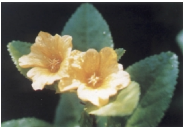
‘Ilima ( Sida fallax ) has small, bright yellow flowers. It is a hibiscus relative. The flowers are made into the lei of O‘ahu.

Propagation. ‘Ilima papa is easily grown from seeds or cuttings.