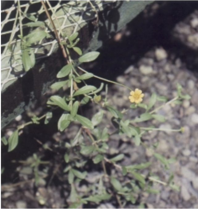
Nehe ( Lipochaeta integrifolia ) is an easy-to-grow sprawling plant with yellow, daisy-like flowers.