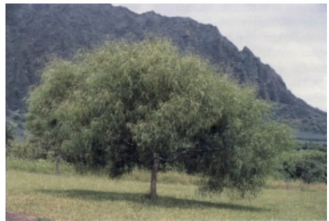
Koai'a ( Acacia koaia ) is a medium-sized, less-thirsty tree, growing here at Ho'omaluhia Botanic Garden.

Other uses. The wood is very hard and dense. In the past, when the tree was more abundant, it was favored for making long-lasting fence posts in pastures. The Hawaiians probably used it for tools and weapons.