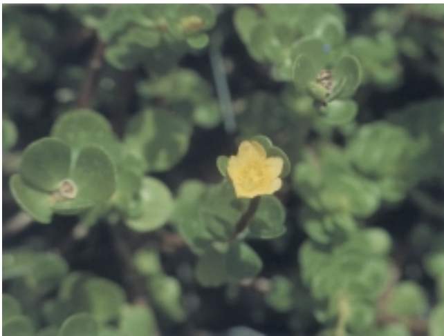
This groundcover or potted plant, ‘ihi ( Portulaca lutea ), has succulent leaves and single-petaled, bright yellow flowers.

Description. Portulacas are small, usually succulent herbs. There are seven native Hawaiian species. There is also a weedy portulacca found in Hawai‘i, the purslane ( P. oleracea ), and a cultivated one, the moss rose ( P. grandiflora ).