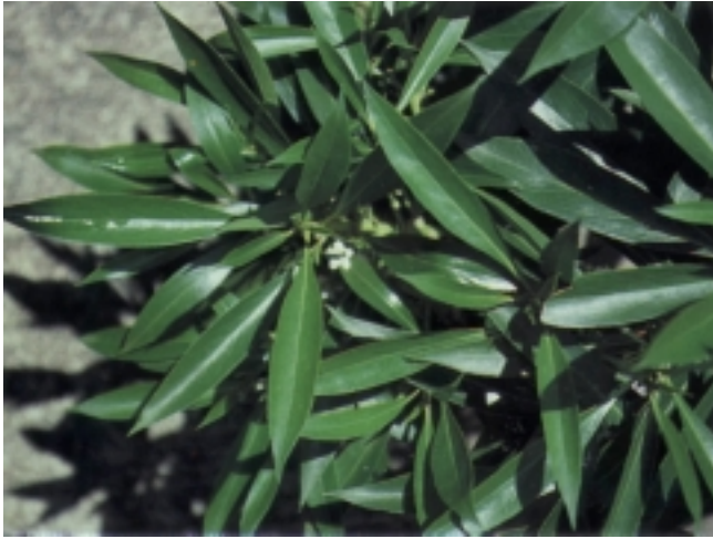
Naio ( Myoporum sandwicense ) is a shrub or small tree, ideal in the landscape or as a potted specimen plant.

Landscape uses. Naio is naturally a shrub or, with time, a small tree. It is a good specimen or hedge plant. Its broad, natural elevational range indicates that it will do well in coastal and upland sites in Hawai‘i.