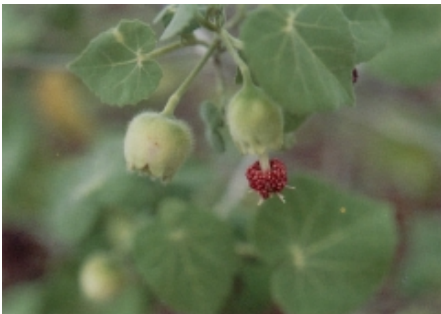
The green petals of this rare hibiscus relative, hidden petaled ‘ilima ( Abutilon erimetopetalum ), are hidden behind the calyx.