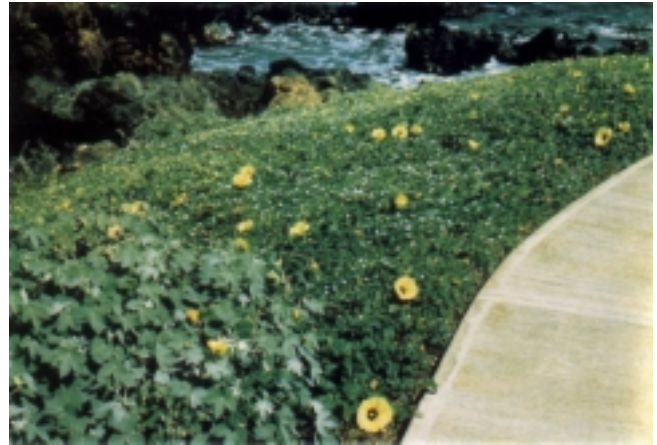
Hibiscus calyphullus in an attractive hotel landscape on Maui. Ma'o ( Gossypium tomentosum ) is in the foreground and pā'ū o Hi'iaka ( Jacquemontia ovalifolia ) is mixed in with the hibiscus. The plants are kept low with a string trimmer. Large, handsome, yellow flowers appear each morning to brighten the landscape.

Propagation. It is easy to propagate from cuttings or seeds. To grow it from cuttings, take a two- to three-node cutting (about 3 to 4 inches long), stick about a third of the cutting in a pot of potting medium, and water it daily. Most well-drained media will work for propagation. Rooting hormone is not needed for cuttings. To grow pā'ū o Hi'iaka from seeds, plant them (there are several tiny seeds to each brown, papery seed capsule) on firm, pre-moistened potting medium. Lightly cover