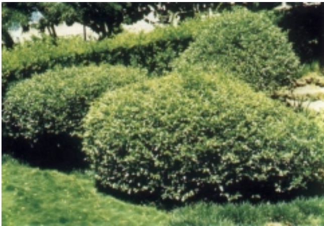
Alaha'e ( Psychradax odoratum ), a less-thirsty shrub or small tree, pruned and shaped into bonsai at the Japanese Garden of the East-West Center at the University of Hawai'i at Mānoa.

Notes of interest. The name alaha'e is an example of the poetic nature of the Hawaiian language. Ala means “fragrant” and he'e means “octopus” or “slippery like an octopus.” Alaha'e has blossoms that you can stick your nose into and smell, but they are better enjoyed by letting the breeze waft the scent to you. The Hawaiians expressed all this as a “slippery fragrance.” Alaha'e has very hard wood with a straight grain. The wood was used for 'ō'ō (digging sticks) and spears.