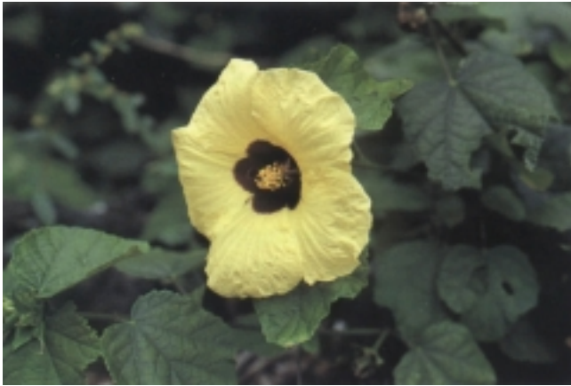
The large, bold, yellow flowers that bloom regularly are a striking feature of Rock's Kaua'i hibiscus ( Hibiscus calyphyllus ). It is useful as a groundcover or shrub.

it can be kept low with a string or blade trimmer. It is also attractive if allowed to grow more freely as a rambling shrub. It can be trained into a hedge. It will grow well in a large pot. The large, clear-yellow flowers, with their velvety, purple-black throats, make striking splashes of color in the garden.