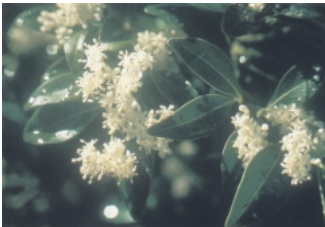
Clusters of fragrant, white flowers enhance the deep green, glossy leaves and white bark of alaha'e.