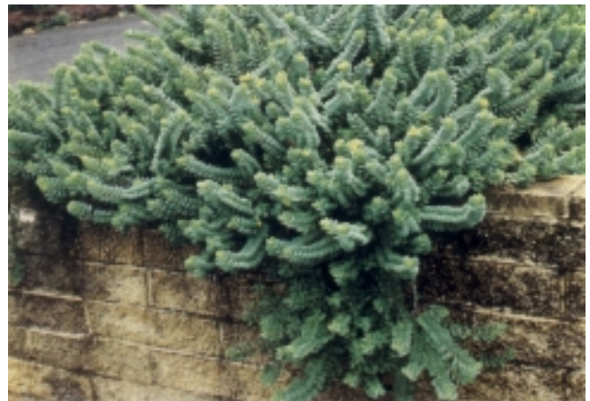
‘Ākia ( Wikstroemia uva-ursi ) is a groundcover plant with imbricately arranged leaves and four-part, yellow flowers that are followed by a red fruit. Here, it sprawls over a tile wall.

Description. ‘Ākia is a small, sprawling groundcover with oval, waxy, green leaves that are arranged in an imbricate pattern. Its flowers are small, four-part, yellow.