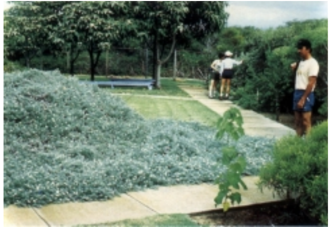
Hinahina ( Heliotropium anomalum ) growing on a mound of sand at the Maui Zoo and Botanical Garden.

Pests. Some sucking insects like mealybugs sometimes attack nehe. Standard insecticides may be used. A wettable powder formulation is best.