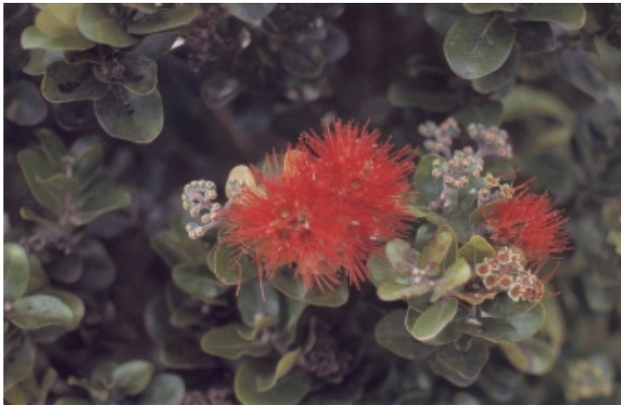
Flowers and leaf buds of ‘ōhi‘a ( Metrosideros polymorpha ) are highly prized for Hawaiian lei.

To grow ‘ōhi‘a from cuttings, a mist system is required. Use of a 10 percent solution of Dip-N-Gro® is beneficial. Select wood ¼ inch in diameter and 4–6 inches long. Tip and stem cuttings with healthy leaves are best. Cut the leaves in half and remove leaves from the lower inch of the cutting. Dip the cutting into the rooting solution for 10 seconds. Good rooting media for ‘ōhi‘a cuttings include a 1:1 mixture of perlite and vermiculite, a 2:1 mixture of perlite and peat moss, and