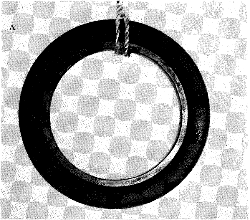
Plate Ia Green-blue glass ring from Tobati village, Humboldt Bay, New Guinea. Outer diameter 10.2 cm, inner diameter 7 cm, thickness of glass 1.6 cm, weight 200 gr.