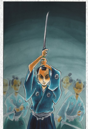
Cover art for 47 Ronin #1

The fact that I have been in the industry for so long that I am now regarded as the old-timer. I was also able to meet my heroes – Stan Lee, Jack Kirby, Neal Adams, and George Takei. Personally, I've been married for 36 years and have two children.