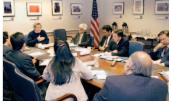
U.S. Deputy Secretary of Defense Paul Wolfowitz meets with senior Asian journalists in Washington, D.C.

To subscribe to EWC Headlines, visit: www.eastwestcenter.org/newsletter.asp