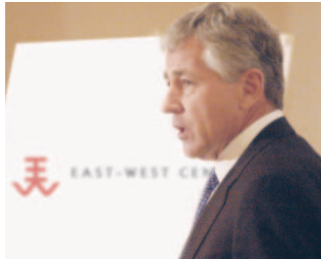
U.S. Senator Chuck Hagel

Hagel noted a "dangerous protectionist streak in Congress," adding that the United States needs new