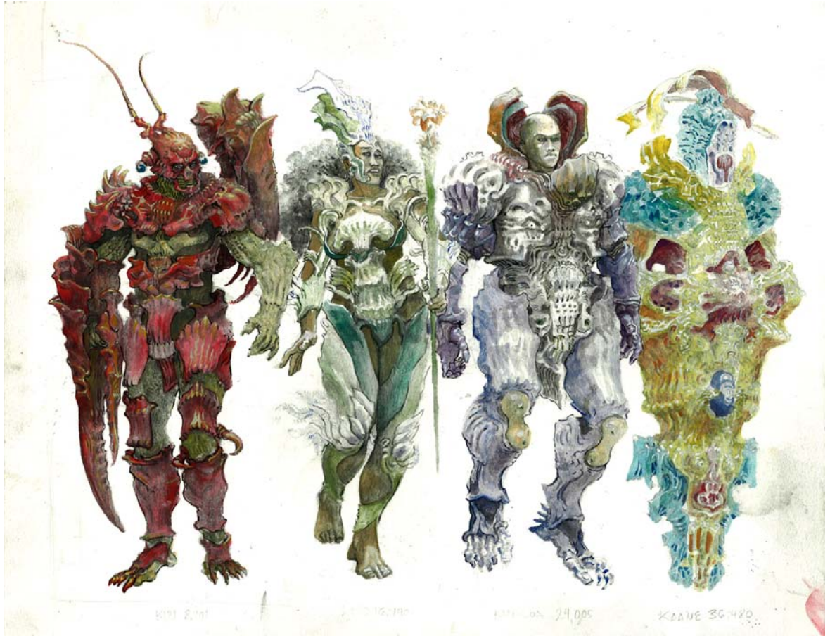
The 40,000 Years of Polyfantastica , by Solomon Enos. 2008. Gouache on 11" x 14" bristol board. In this study for a project Enos is working on called Polyfantastica, each figure represents 10,000 years of fictional history based on a Polynesian society.