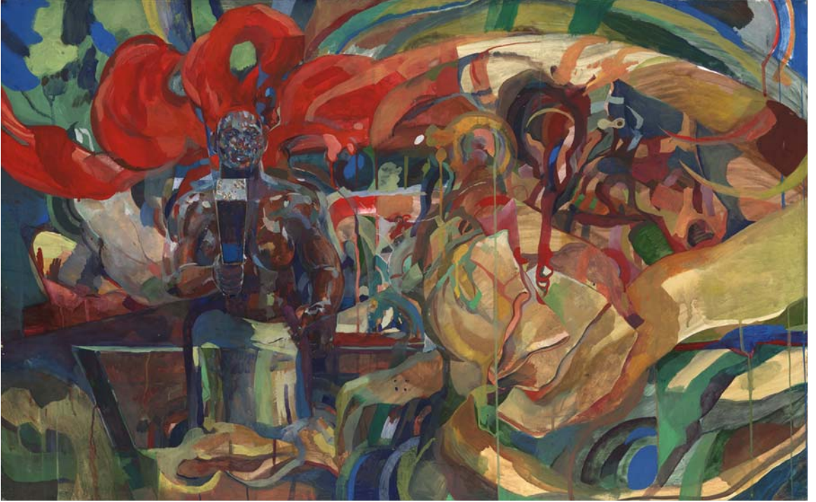
Kapa Maker , by Solomon Enos. 2004. Gouache on 30" x 48" canvas. This is a visual representation of the mana or energy that goes into the making of kapa or barkcloth.