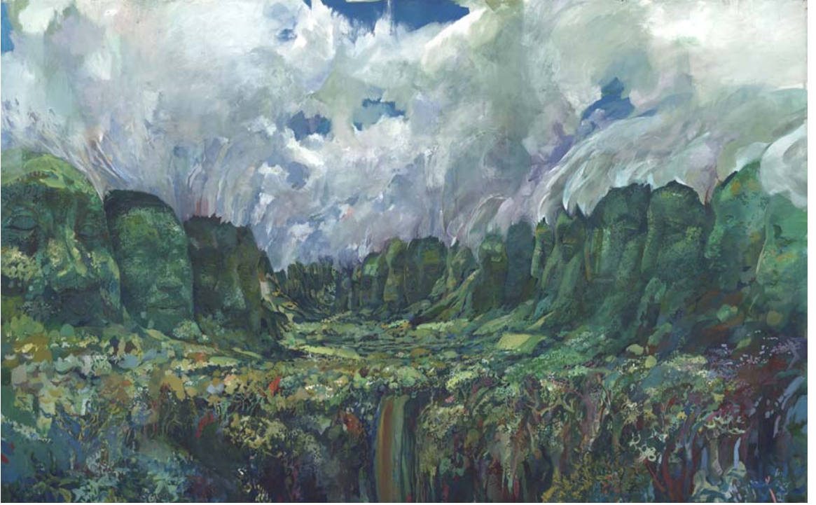
Alo 'Āina , by Solomon Enos. 2004. Gouache on 30" x 48" canvas. This is a visual representation of the concept of sentient landscapes.