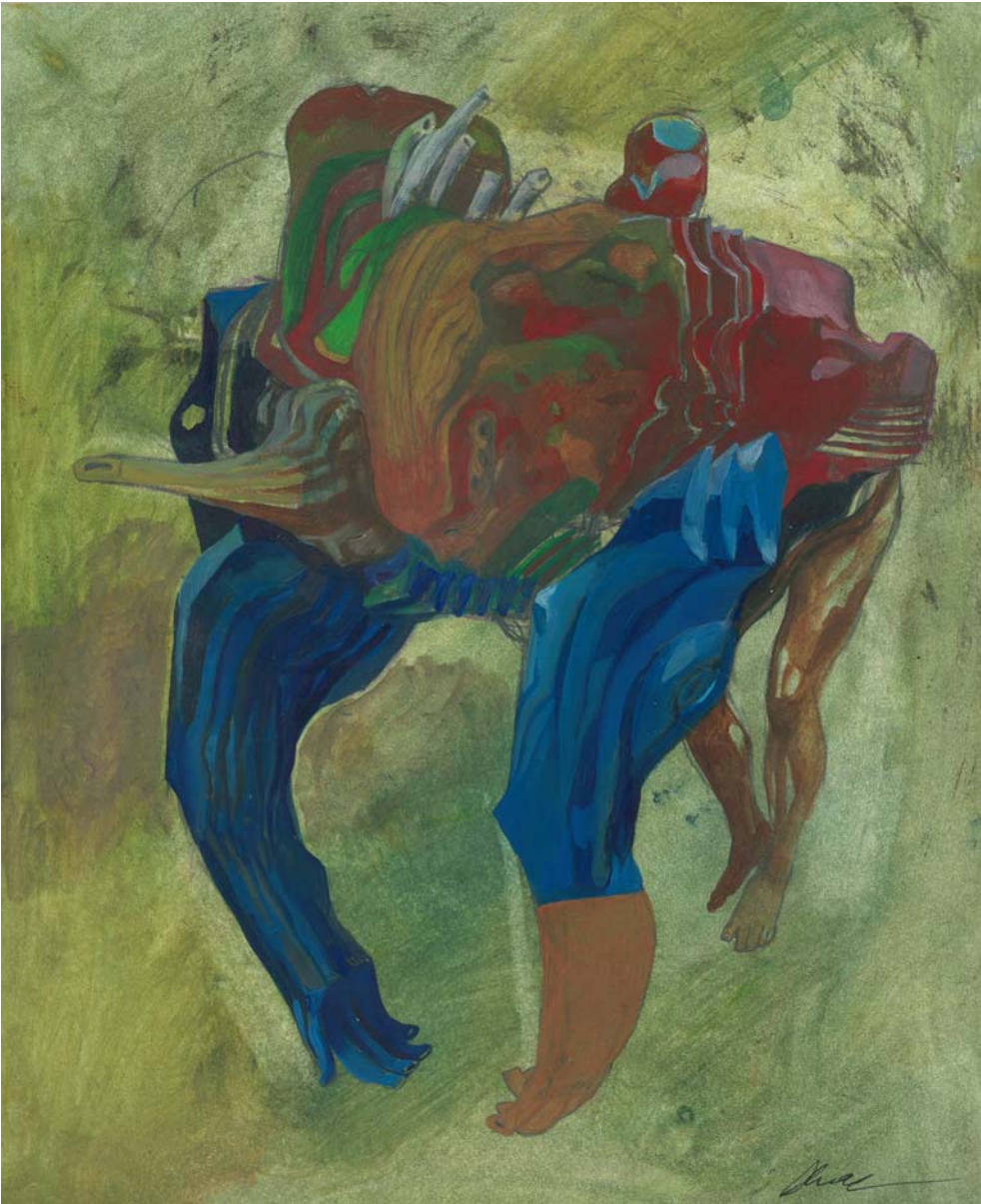
Intergalactic Human Seed , by Solomon Enos. 2004. Oil on 11" x 14" bristol board. This is a study for a future painting in the science-fictional Polynesia setting called Polyfantastica.