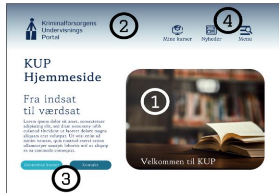
Figure 2. Proposed SKnet homepage with the improvement of four pain points.