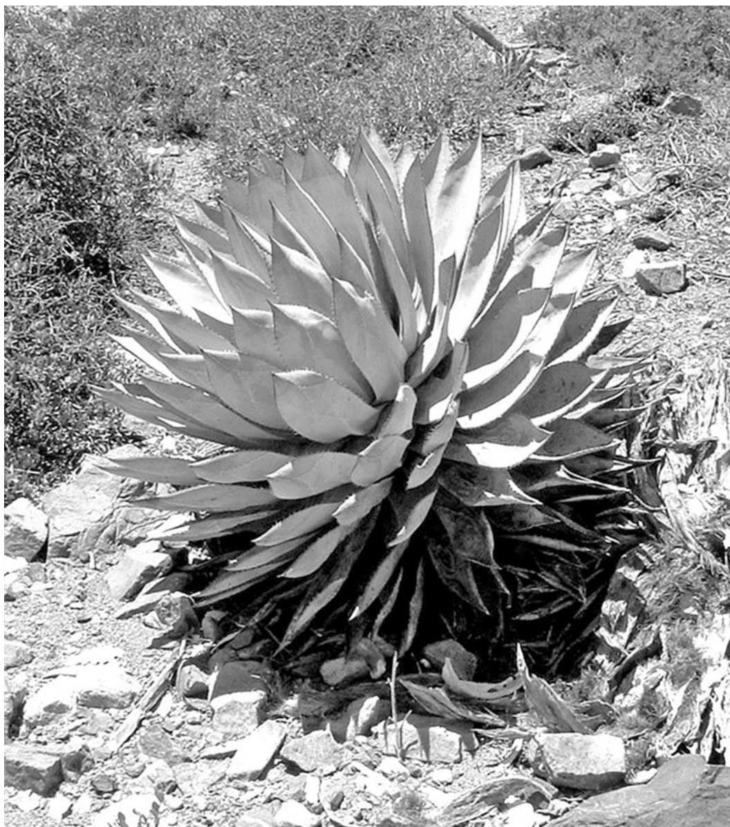
FIGURE 8. Agave shawii on Isla Cedros.

record (Des Lauriers 2005), such a dependence upon this slow-growing plant would undoubtedly have led to a certain level of localized depletion surrounding the larger settlements. Aschmann (1959) described the