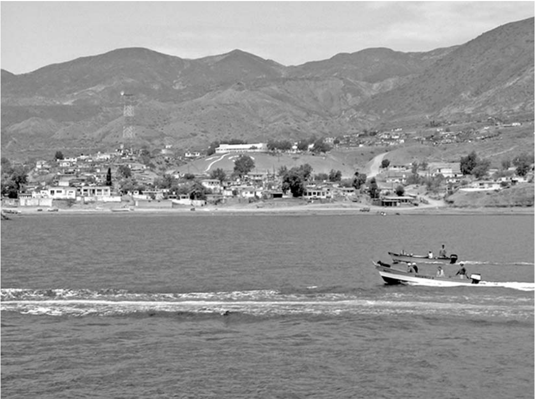
FIGURE 5. A portion of the cooperative town on Isla Cedros and two of the standard lanchas with outboard motors used in virtually every type of fishing or circumisland transport.