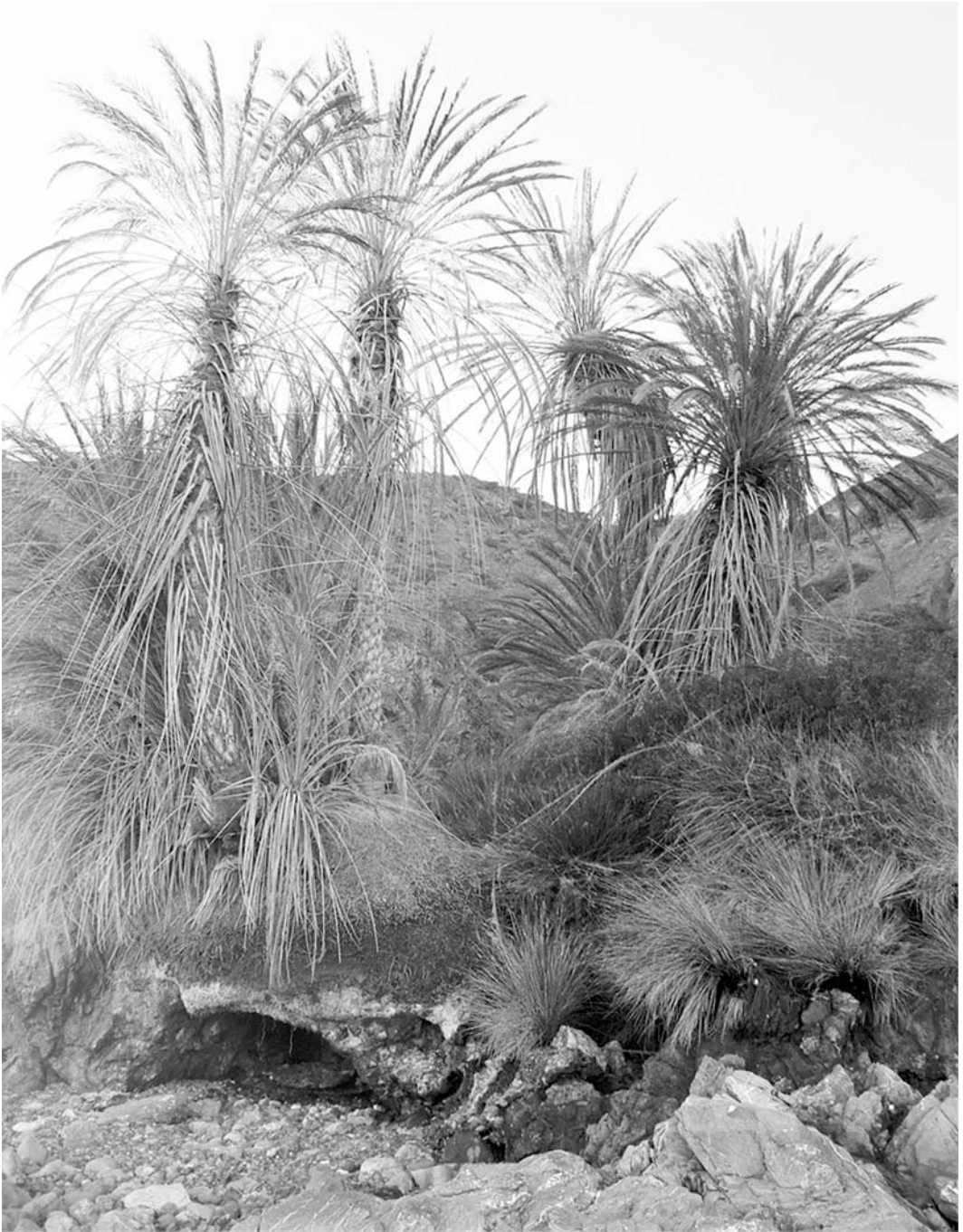
FIGURE 2. "Vizcaíno's Spring," located on the east coast of the island.