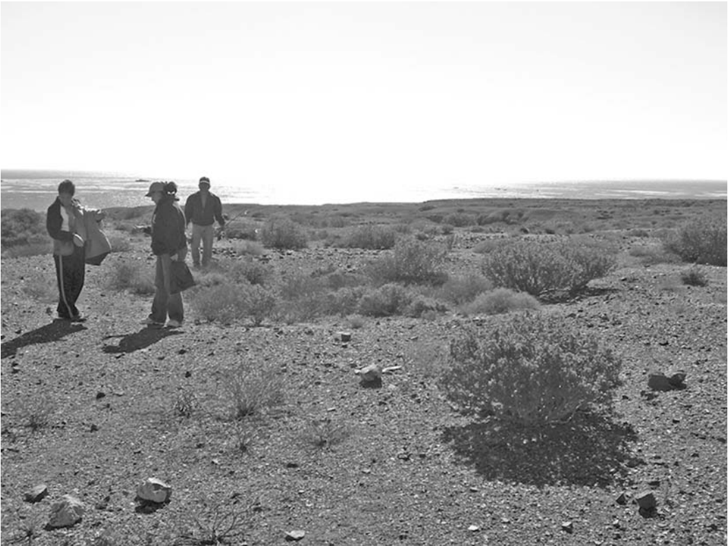
FIGURE 7. One of the larger house features at the site of Punta Montero, located on the southern bay of Isla Cedros. This feature is part of a cluster of approximately 30 houses, each ranging in size from 8 to 13 m in diameter.

gested by both the eyewitness accounts (i.e., Des Lauriers and García–Des Lauriers 2006) and cross-cultural comparisons. The potential ecological significance of such a community-based holding of resource rights is of great interest, and future research will help to establish the details of such a system.