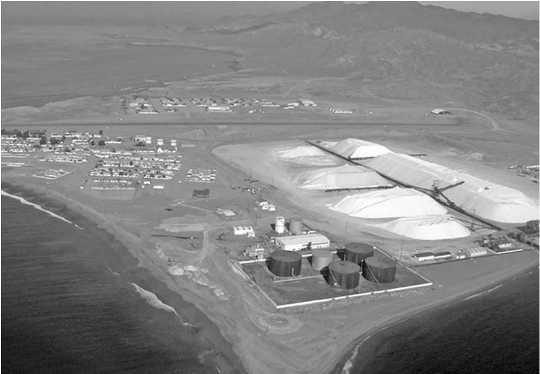
FIGURE 4. A view of the southeastern corner of Isla Cedros, showing part of the Mitsubishi/Mexican government-owned salt-transshipment facility (ESSA).

The marine ecology of Isla Cedros appears to be remarkably resilient, having weathered the same El Niño events and broad-effect perturbations as the Alta California coast. This resiliency represents one point of difference between the northern and southern portions of the Californian marine biogeographic zone, which runs from Point Conception in the north to Punta Eugenia in the south. As numerous scholars have observed, “The Santa Barbara Channel area is susceptible to El Niño/La Niña cycles, intensive droughts, and other climatic perturbations” (Rick et al. 2008:79). The plant and animal communities of Isla Cedros differ in their ecological response to these large-scale variations, because in contrast to the depleted situation in the southern Alta California portion of the “Bight,” in the waters of central Baja California, there remain strong, commercially