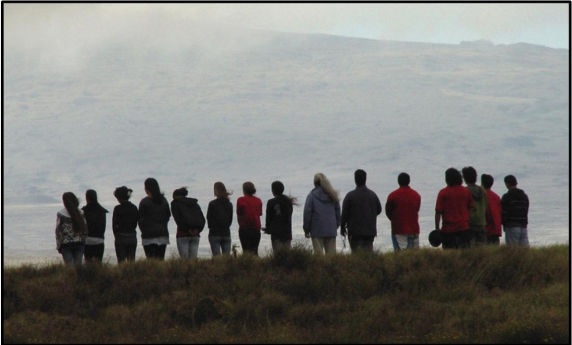
The high school class of Pu'ukapu Project stands with the three kumu (teachers) in the center, the girls lined up on the left and the boys on the right. Four mornings per week they perform their protocols in the lee of majestic Mauna Kea as clouds sweep across the summit.