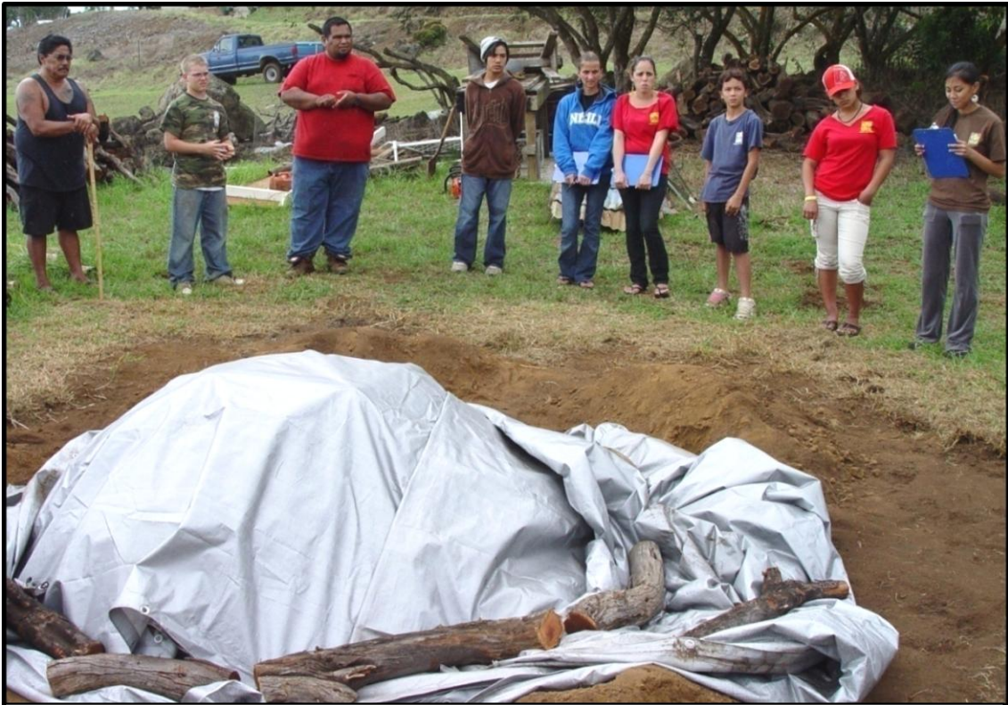
With imu (underground oven) preparation complete, the group gathers for final thoughts and a concluding chant.

In Hawaiian cultural thought it is not proper to leave an open pit over night waiting until tomorrow when they would put the pig in it because an open pit is like an open grave that invites all the wrong spirits to come and take up residence. They covered over the pit with a tarp weighting it down with rocks and logs. Then all the students and the men from the community with cultural knowledge of how to properly dig an imu (underground oven) formed a circle around the covered imu. Aunty Nicole led the group in summarizing what they had done that afternoon and the steps they had taken to ensure that all was done in a pono manner, concluding the afternoon's work with chants.