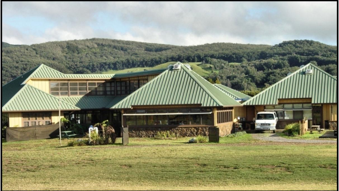
The Hālau Ho'olako center built on Hawaiian Homestead Land is designed to blend into the Kohala Mountains. Until this facility opened in January 2009, all education was provided in borrowed or makeshift facilities.

underlying philosophical reason why the focus of education lies outside of the classroom.