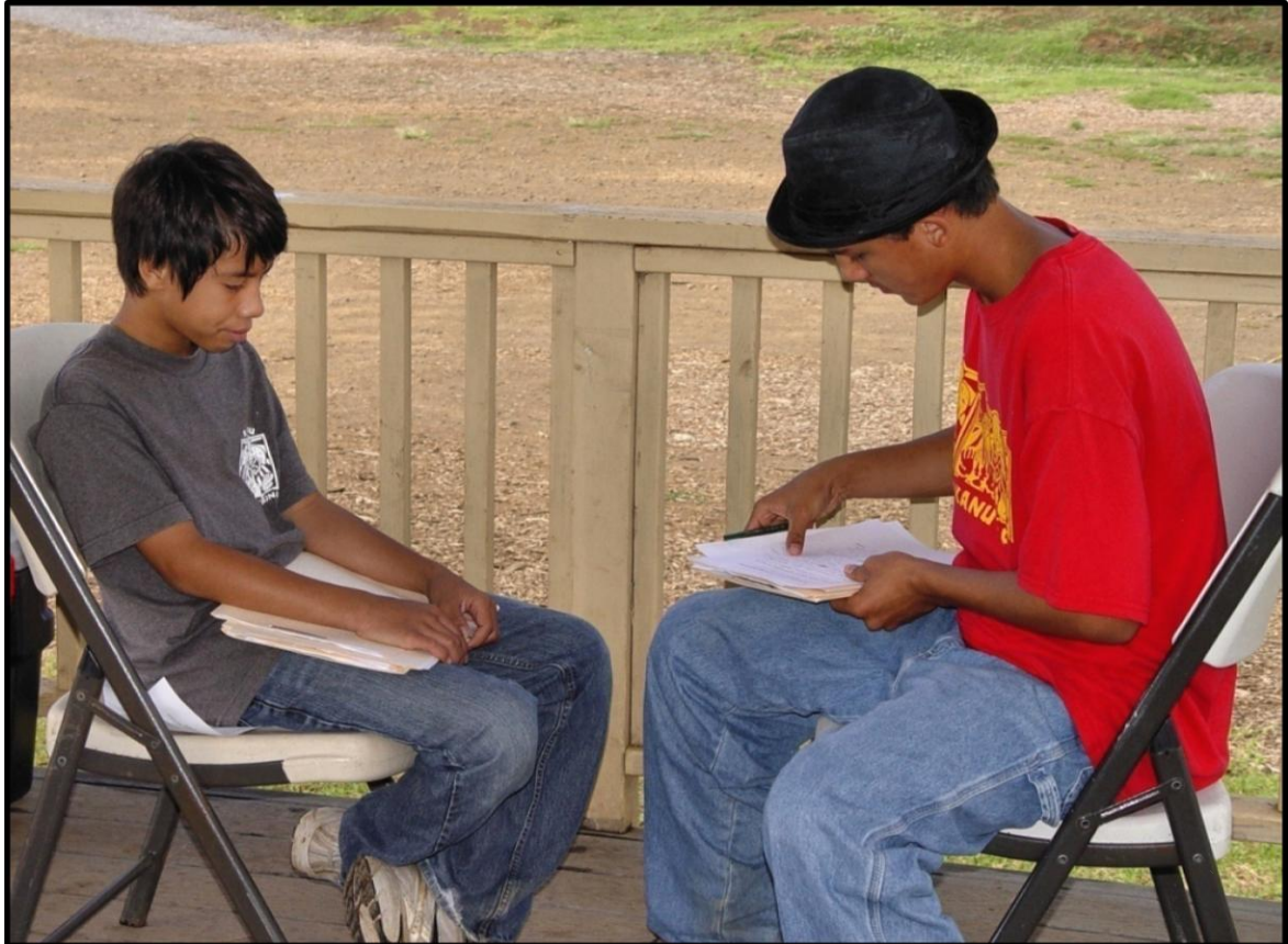
In preparation for the Student Led Conferences, a high school student with experience leading his own conferences, helps a sixth grade student rehearse.

This exemplifies one of the Hawaiian proverbs that illustrates a cultural value: “Kōkua aku, kōkua mai pēla ihola ka nohona ‘ohana” (To give and receive help such is family life) (Nā Lei Na‘auao, 3.)