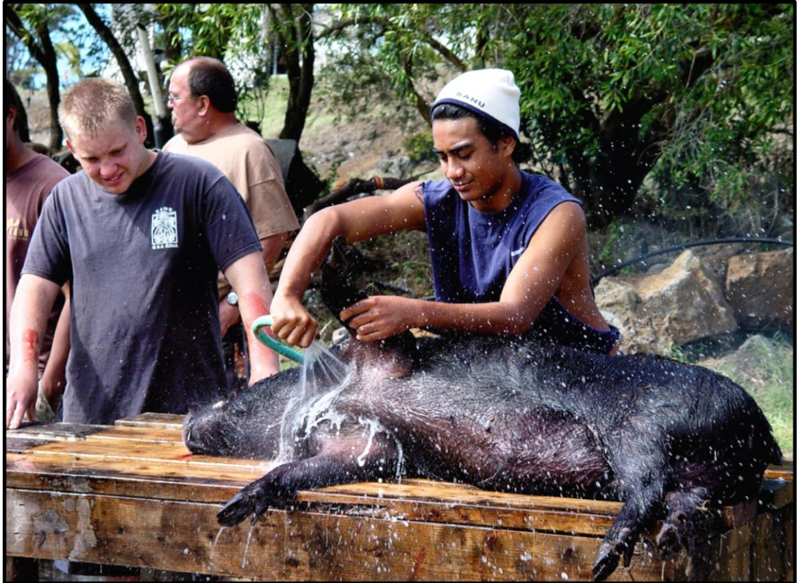
A middle school student watches as his high school classmate cleans the pig.

It was only when the pig was being made presentable did the girls of the class arrive for the rest of the tasks. After scrapping off all the hair, they gutted the pig removing the internal organs, being careful to remove the entrails intact. These entrails were made into a local delicacy called a “loco”. The students salted the pig using Hawaiian salt.