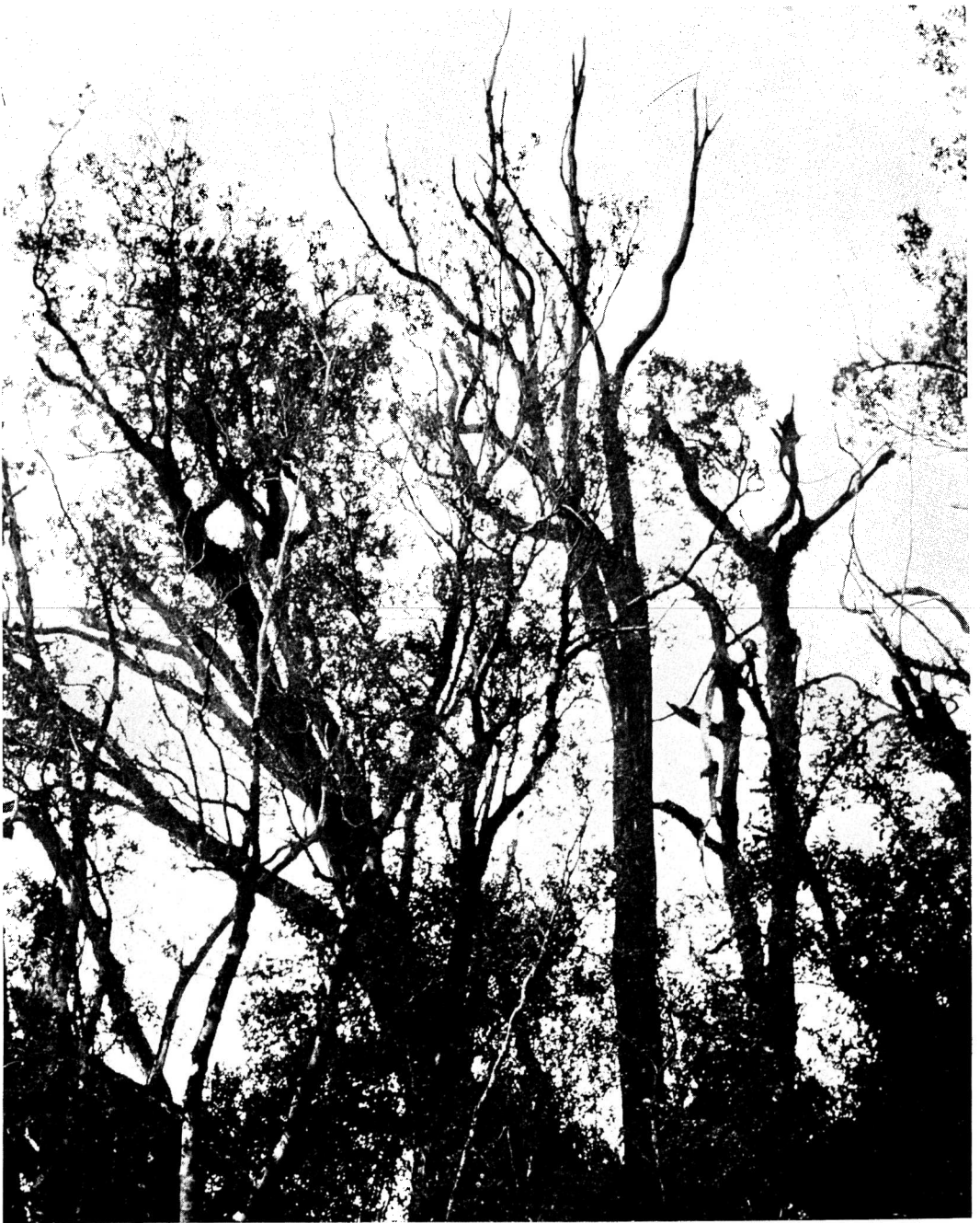
FIGURE 4. Profile of a low-altitude dieback stand with live kamahi and Quintinia acutifolia trees; the dead trees are southern rata and Hall's totara. The dominant shrub tier species are Coprosma foetidissima and Pseudopanax simplex .