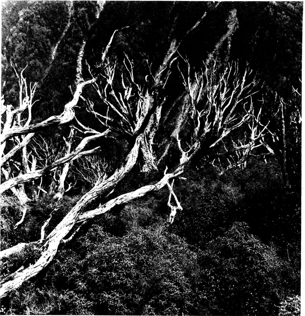
FIGURE 3. A stand of dead southern rata trees emergent through a dense shrub tier at 700 m altitude. Live broad-leaf trees remain in the canopy.

mainly kamahi and some southern rata, was described by Chavasse (1955, unpublished) as spectacular, particularly on steeper slopes. Open-canopied forest developed where dieback took place.