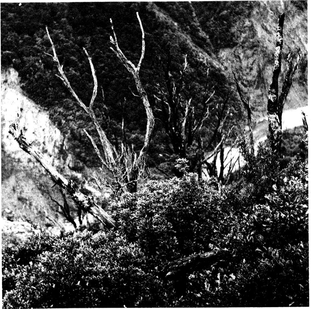
FIGURE 2. Dead southern rata, kamahi, and Quintinia acutifolia trees in a stand at 500 m altitude. The dominant species in the shrub tier are Q. acutifolia and Pseudowintera colorata .

slides near intact forest. From field observations, few southern rata seedlings were present on recent landslide surfaces greater than 300 m from seed sources. Browse on southern rata and kamahi seedlings present on landslides was attributed to brush-tailed possums. Important colonizing species on these primary sites were Carmichaelia c.f. grandiflora , Olearia avicenniaefolia , and (at higher altitudes) Dracophyllum longifolium .