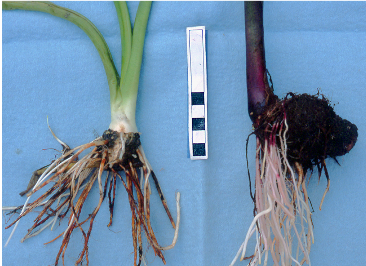
Figure 2. Wildtype taro (green petiole with stolons and small corm) and a domesticated form (purple petiole with larger corm) from a stream on Amami Island, in the Ryukyu Archipelago of southern Japan. The wildtype is locally recognised as a plant that was used until the mid-20th century as pig fodder, after cooking. The plants shown here grew side-by-side on a gravel stream bank, below the site of a former settlement. The wildtype is commonly found in disturbed habitats near past or present settlements. The domesticated form is presumably a garden escape, and was not seen in other locations with the wildtype. (April 2001).

Taro in its natural state is a semi-aquatic tropical herb, and can easily become weedy in disturbed or managed habitats that are warm, wet and open to the sun (Figure 2).