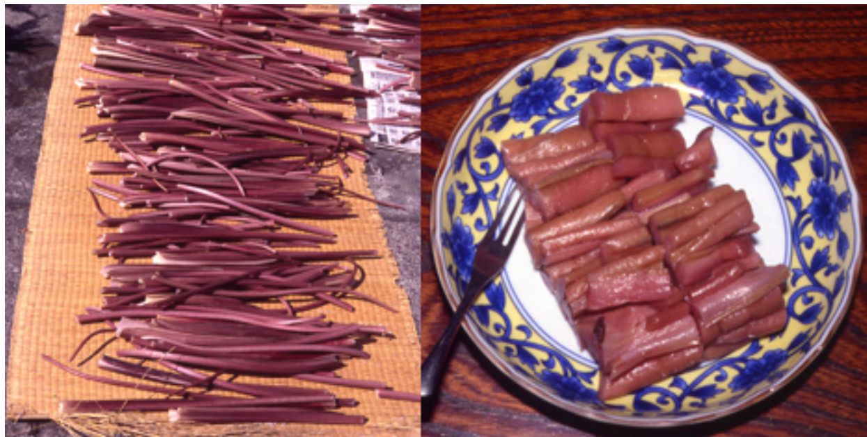
Figure 9. Edible taro petioles ( zuiki ) from a cultivar of C. esculenta ( akazuiki ), (A) placed in sun to dry before peeling and storage, (B) peeled while fresh and served after pickling in weak vinegar. Nigata Prefecture, Japan (Oct. 2000).

- are usually made using the wetland taro (Matthews field notes 2001).