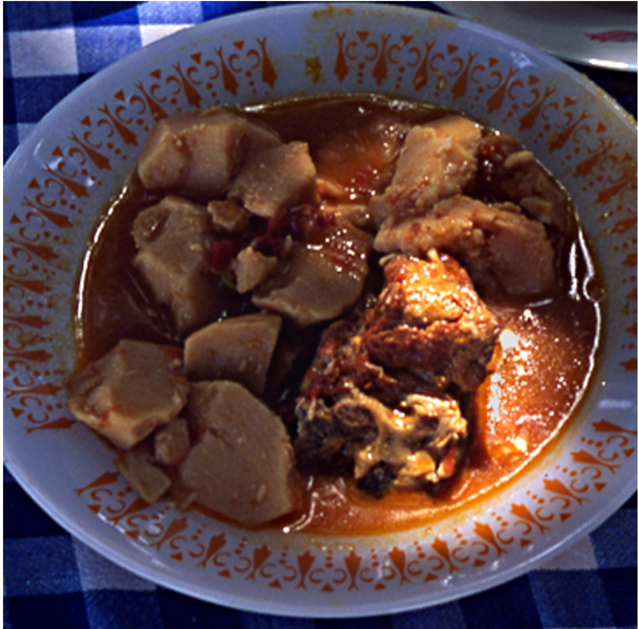
Figure 4. Taro stew in Cyprus ( kolokasi yiakhni ), prepared with taro, onion, tomato, celery, lemon juice and pork (Sept. 1996).

Taro is essentially unknown in central and northern Europe, but is likely to have reached Cyprus in ancient times from India or Africa, via the Levant or Egypt. Taro in Cyprus has been integrated into a cuisine that is best described as Mediterranean. One of my main interests in Cyprus was to see how taro is used by people with a cuisine that is close to European. Most Europeans and their descendants have never eaten taro, or do not enjoy it, but do enjoy Mediterranean food. The author of one New Zealand cooking book has described cooked taro as 'a