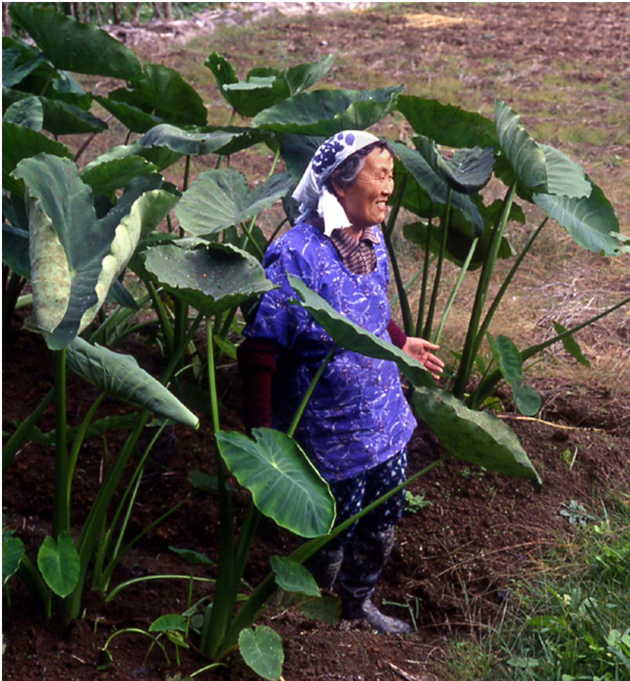
Figure 6. Farmer with dryland taro, Nigata Prefecture, northern Japan (Oct. 2000).

types). Taro in the south can be grown year round, in a continuous temporal succession of crops, although there is some seasonality. Certain recipes are particular to wetland taro, or ta-imo, and other recipes are common to a range of dryland cultivars, which are grouped together as chinnuku. The wetland or dryland distinction is important throughout most of the tropical Pacific.