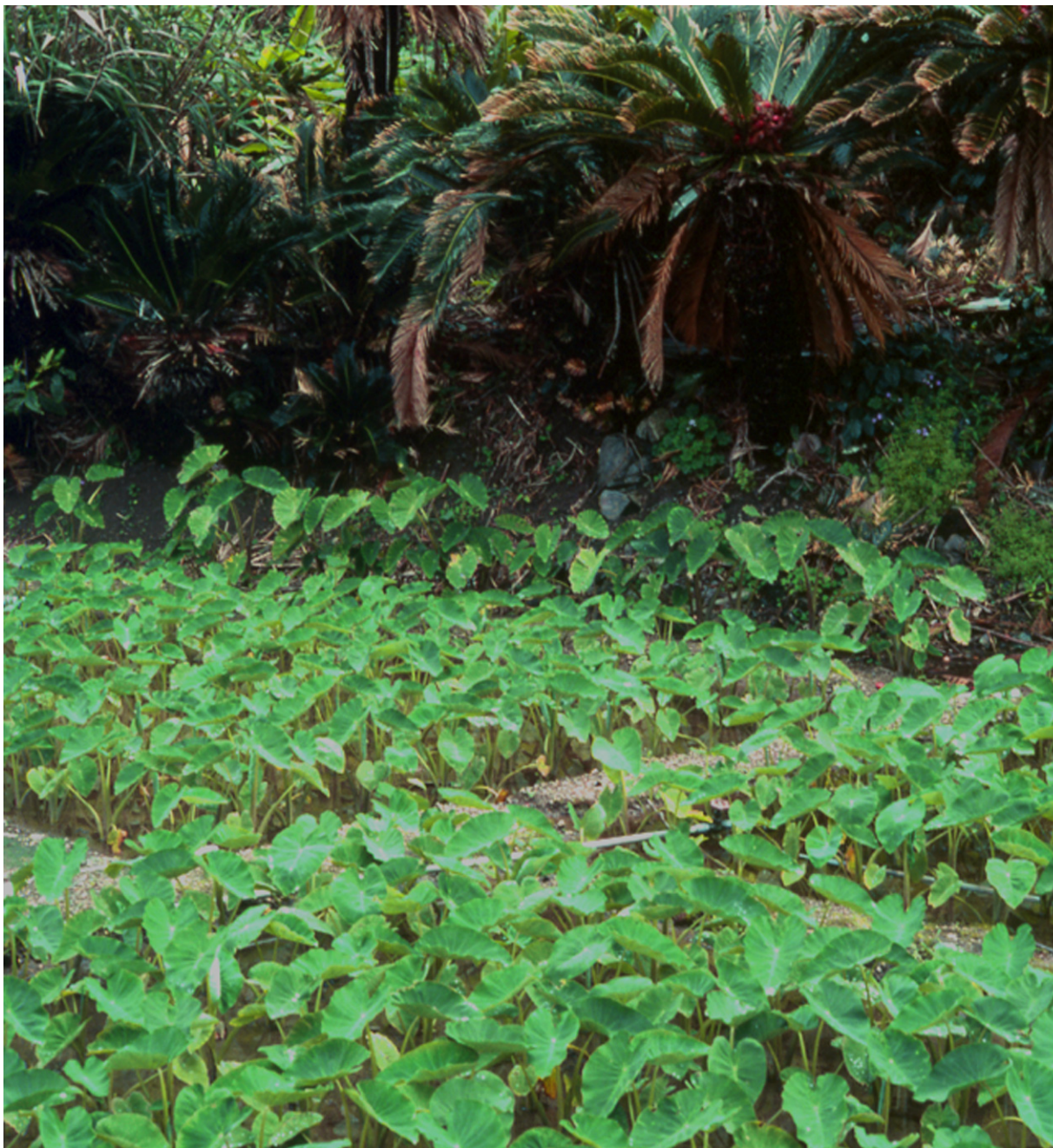
Figure 5. Wetland taro ( ta-imo ) in ponds, below a plantation of a tropical coastal cycad, Cycas circinalis L., Amami Island, Ryukyu Archipelago, southern Japan (April 2001).