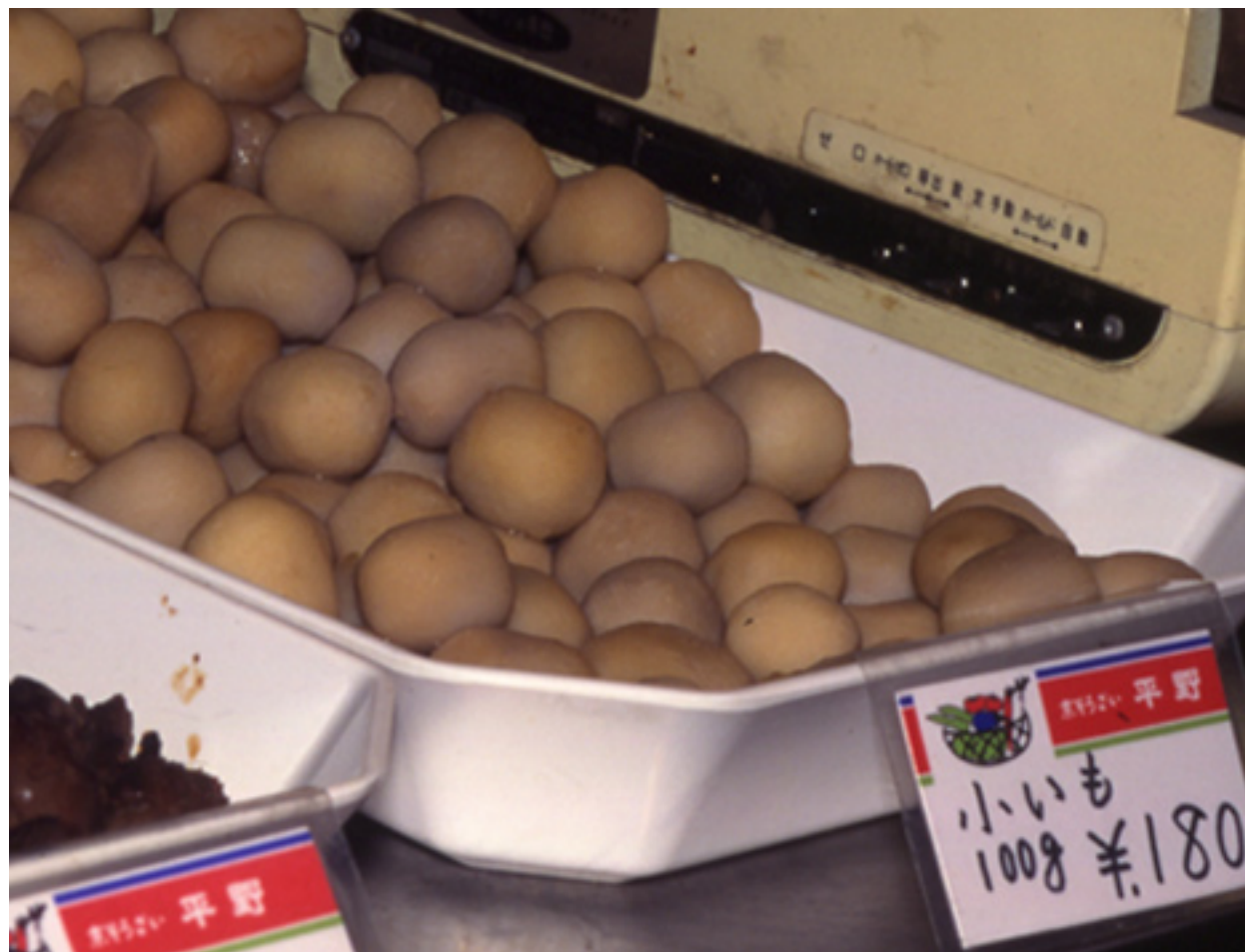
Figure 7. Small child-corms ( ko-imo ) after boiling in a flavoured sauce, and sold as fresh product, in Kyoto, Japan.

Taro dishes commonly referred to as nimono (boiled materials, Figures 7 & 8) and miso-shiru (hot soups made with paste from fermented soybean as flavoring) are most common. These kinds of dishes are not unique to taro, and are found everywhere in Japan. They are mainstay side-dishes, almost always eaten together with rice, and taro is just one of many possible ingredients that can be used. The encyclopedia Japanese Food Eating Styles also mentions many taro dishes just once or a few times. These may include uncommon dishes that are not widely known, and common dishes that have many different names. Specific taro cultivars may be used for specific dishes, but in most cases, taro is not referred to using cultivar names. Dishes in which taro is boiled and then mashed and flavored in various ways appear to be a distinctive component of cuisine in the far southern islands of Japan. These mashed taro dishes - numuni and others