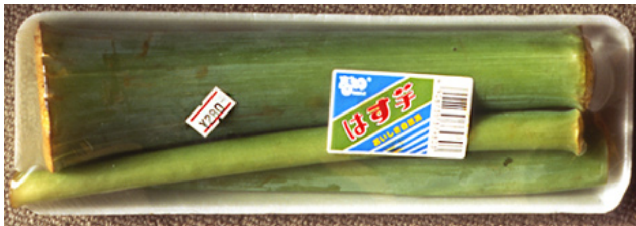
Figure 10. Edible petioles ( zuiki ) from C. gigantea ( hasu-imo ) as sold in a supermarket in Kyoto city, Japan (July 1996), Only one cultivar of this species is known in Japan.

Analyzing the data in Japanese Food Eating Styles has only just begun. Initial examination indicates that the diversity of culinary methods applied to taro is positively