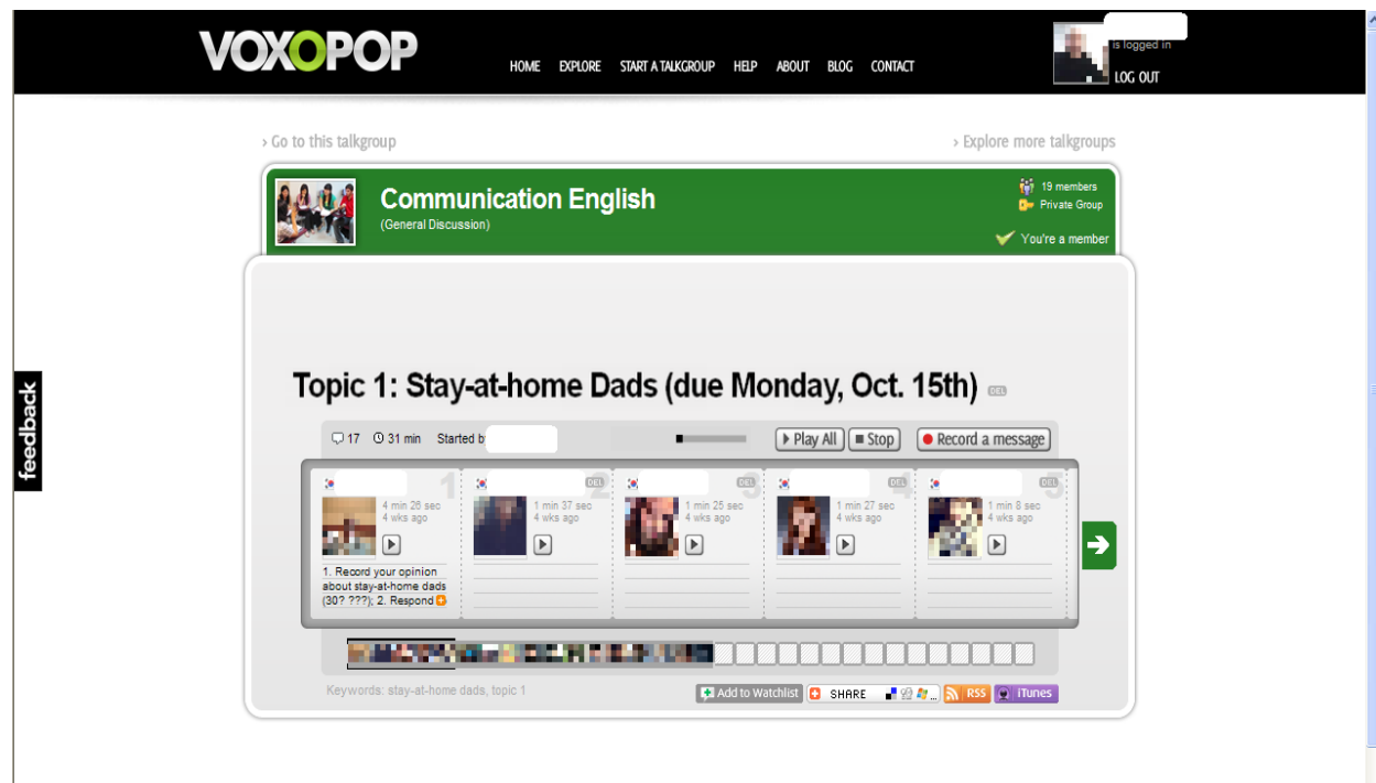
Figure 1. Screenshot of the Voxopop interface.

Voxopop posts are displayed linearly in the discussion thread (see Figure 1 , which has been edited to protect participants' identities). The teacher modeled the process of recording, reviewing, publishing, and listening to other posts several times during class. After introducing the voiceboard, students were assigned a homework task (i.e., self-introduction) to demonstrate that they could use the technology. All students completed this assignment and reported no problems.