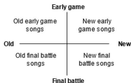
Figure 1. The four dimensions measured in this study.

In this work, we observed differences between players' reactions to songs appearing early on (during the first hour of play) in adventure games and songs appearing at the end (i.e. final battle music). We formed two clusters of games based on when they were released to explore potential differences in nostalgic sentiment. The first cluster had games released between 1996-2004 and the second had games released between 2015-2019, meaning the two comparison clusters were roughly 10 years apart. We always selected the early game song and the final battle music from the same game, and chose to look at five games for each cluster. Thus, we had 20 unique songs across 10 games, which were mapped into four clusters depicted in Figure 1.