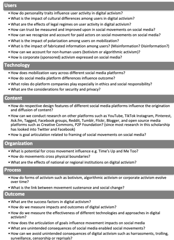
Figure 5. Potential research questions.

We summarize potential research questions in each dimension in Figure 5 below.