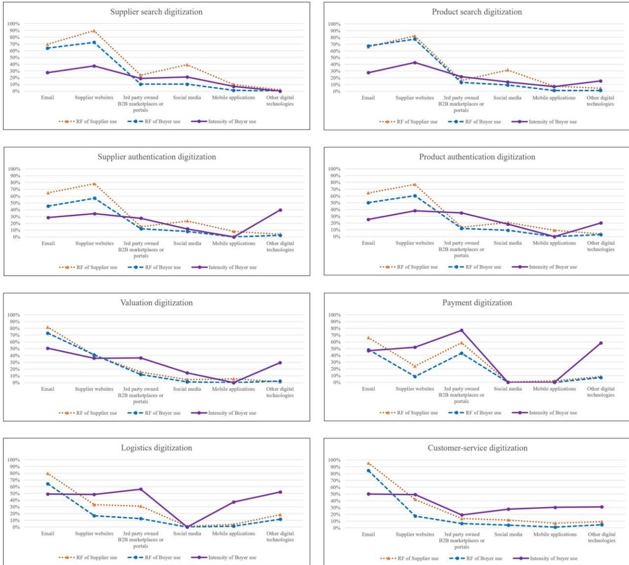
Figure 1. Digital technology use per process