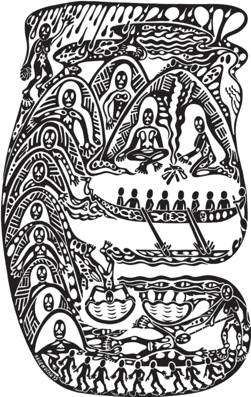
The Lebon Brothers