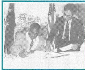
Pictured above: John Kaputin, Minister for Foreign Affairs, Papua New Guinea signs JCC memorandum of understanding witnessed by Jioji Kotobalavu, Executive Secretary of JCC (at right).

A comprehensive study of international trade/investment will focus on how regional arrangements, such as the U.S.-Pacific Islands Joint Commercial Commission (JCC), can be used to strengthen trade interdependence among the Pacific islands, Asia, and the United States. A preliminary draft analysis of intra-regional trade and investment of the Pacific island and Asian economies has been completed and will be available for distribution during 1993. Implementation of the project focusing on trade and investment issues relating to the JCC will begin after the recruitment of a trade and investment specialist in 1993.