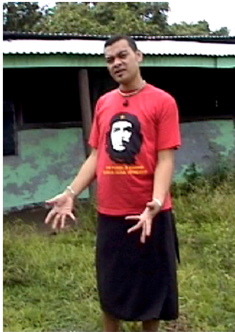
PHOTO 4. Pita reclaiming the sulu. Photo by author, 30 October 2002.

The symbolism that is part of these efforts to reclaim the sulu, to my mind, has an important political significance. By attempting to individualize the way in which the sulu is worn, I would argue that these activists were able to challenge mainstream conceptualizations of indigenous iden-