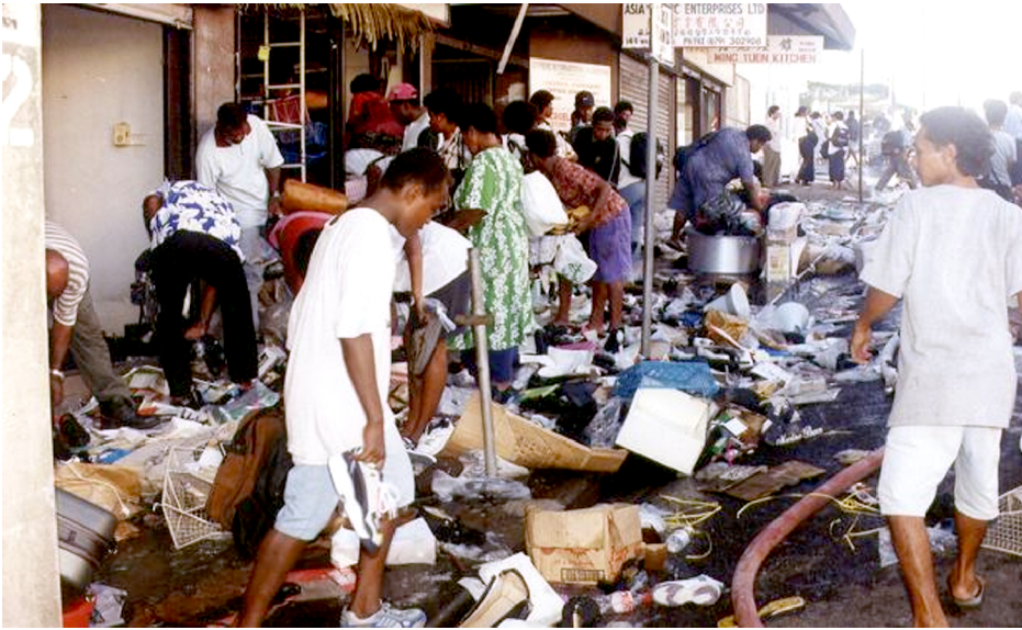
PHOTO 1. Looting Central Suva, 19 May 2000.

bilizing roles—for the most part, escaped retribution. While investigations into the activities of more than two hundred fifty rebel supporters began at this time, efforts focused primarily on identifying sympathizers within the military. In order to reduce tensions, the interim government emphasized reconciliation and national unity over retribution, moves that ultimately meant that aside from those more directly implicated in the coup leadership, the majority of those charged with lesser coup-related offenses received lenient treatment. 13