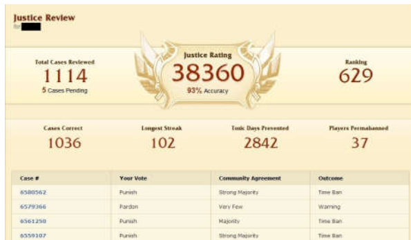
Figure 3. Justice Review in the Tribunal.

The Tribunal system helped the formation of what Kou and Nardi consider as a hybrid system of governance [22], where players and Riot Games work together to govern the LoL community. During the functioning period of the Tribunal, players engaged in interpreting Riot Games’ ambiguous rules, the “Summoner’s Code,” as well as articulating player norms.