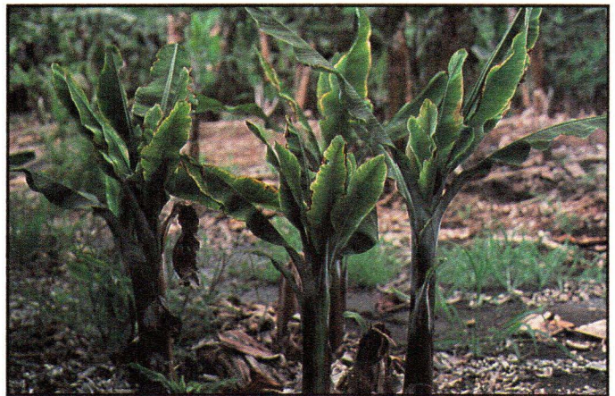
Figure 3. Advanced symptoms: stunted plants displaying narrow, erect, stiff leaves with marginal chlorosis and burning. Notice, also, the rosetting or bunching of leaves at shoot apex of diseased plants.

Keikis or suckers that develop after infection are usually severely stunted, resulting in leaves "bunched" at the top of the stem. Leaves are usually short, stiff, erect, and more narrow than normal. Leaves display marginal yellowing or chlorosis and necrosis or burning (Figure 3). These plants will not produce any fruit.