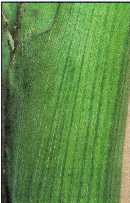
Figure 1. Initial symptoms: dark green interrupted (or "Morse code") streaks on midribs of infected banana plants.

The first symptoms consist of darker green streaks on the lower portion of the midrib, and later on the secondary veins of the leaf. Removing the "white fuzz" or wax covering the midrib makes it easier to see the streaking clearly. Streaks consist of a series of "dots" and short lines often referred to as "morse code" streaking (Figure 1). As infection progresses, streak symptoms become evident on the leaf blade (Figure 2). When fruit is produced, some of the hands may have distorted and twisted fruit.