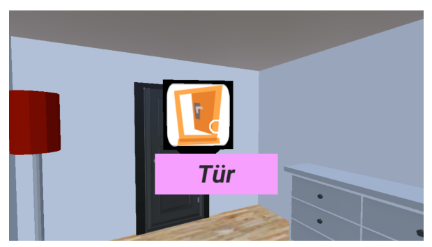
Figure 1. Locus in the image-text VMP

As described, navigating in the VMPs was done by using the gaming controller and the head movement. In order to ensure that participants adopted this way of walking through the VR, each participant had to pass a training level. After finishing their training, they were "transported" into the actual VMP to start the memorization phase. Not only the VMPs, but also the training levels differed between the two groups. Figure 1 shows the locus of the VMP of the image-text group (T\ddot{u}r = door) .