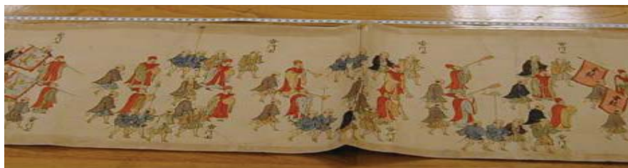
The scroll under restoration at the National Museum of Japanese History