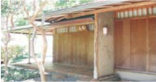
The Tea House at the University of Hawaii

The Tea Center now has an email account. Please email wayoftea@hawaii.edu to contact the Tea Center.