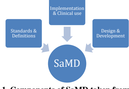
Figure 1. Components of SaMD taken from the literature [2, 26-87]

These sub-themes were aggregated to the major themes as represented in Figure 1 and contribute to the understanding of SaMD components [2, 26-87]. Further analysis revealed what is currently missing from the SaMD components and. Interestingly, what is omitted from the literature is any comprehensive discussion of privacy. Hence, further research regarding the role of medical apps, and the impact on privacy is needed. The literature provides some indication of the boundaries of SaMD, and suggests that components such as privacy, software and IT system safety standards are highly important.