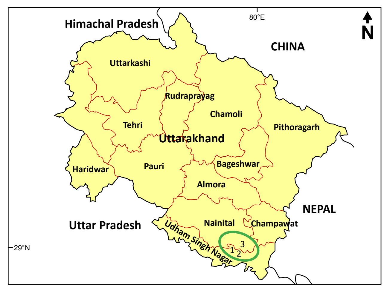
Figure 1. Study area in the tarai region of Kumaun hills, Uttarakhand, India. Study sites: 1) Pantnagar; 2) Kichha Tehsil; 3) Lalkuan.

verse ethnobotanical purposes. Additionally, they have added to the native flora of the region through introduction of economic species from their respective native places.