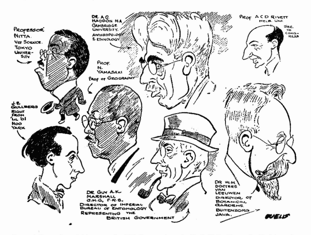
FIGURE 4. Impressions of delegates to the 1923 Congress drawn by H. G. Wells.

entific "League of Nations," admittedly an association of former allies, but one that transcended colonial and national rivalries. It was not yet representative of the Pacific islands, but it was a step toward uniting the region. It was, moreover, a regional application of the global ideal, popularized by the BAAS, an institution dear to Anglo-Saxon scientific practice, and a way of embracing all fields of knowledge while giving equal time to each specialty. The convivial and collegial atmosphere associated with the BAAS was essential to the message of Pacific unity.