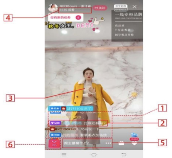
Notes: 1- Public scrolling text screen; 2- Message from online viewers; 3- Internet celebrity; 4- the number of online viewers (8815); 5- Dialog box; 6- Linkage of product presentation

In 2016, e-commerce live streaming services, as a new online marketing mode, occurred in Chinese ecommerce websites (e.g., Taobao, Mogujie, and Jumei), which increased the conversion rate of Taobao by up to 30%<sup>3</sup>. The possible reason for the success of such a service is that its distinguished characteristics help to mitigate lifestyle fit uncertainty for online consumers, which we next describe. The first characteristic is that its service content is IT-mediated and lifestyle-centric. The service content is IT-mediated as it is a marriage of a "grassroots" Internet celebrity's behaviors (see Picture 1) and information communication technology (ICT) capabilities; that is, various ICT capabilities of a living streaming platform assist the Internet celebrity to transmit marketing information for online viewers (i.e., consumers) [15]. Grassroots Internet celebrities are ordinary people who broadcast live streaming shows and are acknowledged by lots of fans (i.e., online viewers) as having similarities in life values and consumption preferences with the fans. Some of them are well-trained with product knowledge and marketing skills, and work at e-commerce websites as marketer influencers. Thus, we defined IT-mediated service content of e-commerce live streaming as the functions of transmitting marketing information to assist online viewers in making purchase decisions [14].