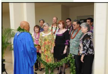
Traditional Hawaiian blessing at the entry to Webster Hall. The UH THSSC will be located on the 3rd floor.