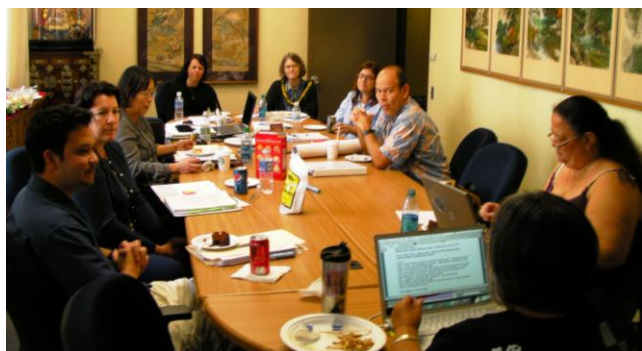
Curriculum workshop participants.

The teachers’ suggestions are being incorporated into the final curriculum which will be launched via the CPIS website before the start of the 2012–2013 school year. The goal is to provide a Hawai‘i State standards-based resource for Hawai‘i social studies teachers who teach Hawaiian Studies and Pacific Island Studies to 7th grade students.