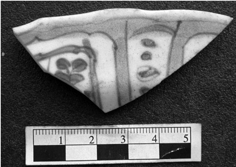
Fig. 2. Rim fragment of a Jingdezhen Kraak porcelain with panel design (B15-6); UMMA 18458, photo no. 8393.

inferior quality copies of Jingdezhen wares; these were called Swatow wares before their production sites were identified (Harrison 1979). Although the Zhangzhou workshops copied Jingdezhen products, they did not necessarily copy their production techniques. Instead, the Zhangzhou potters modified local technological traditions, which favored large volume firing over quality control, to facilitate mass production. For instance, Zhangzhou production employed large step-chamber kilns that can fire significantly more vessels than the smaller gourd-shaped kilns used in contemporaneous Jingdezhen production (Figs. 3, 4). Since the mid-1990s, dozens of such production sites have been identified in the Pinghe region, which lies upstream from Yuegang, and they are collectively called the Zhangzhou kilns (Fujian Provincial Museum 1997). Although we may now confidently attribute many Late Ming specimens to the Zhangzhou region, and even specific kilns in the Wuzhai Township of Pinghe County (Fig. 5), there still remain some unidentifiable fragments, which were likely produced in as yet undocumented kilns in other regions of Fujian and the adjacent Guangdong province. A similar problem also exists for the Jingdezhen kilns, where research on commercial kilns falls far behind the research on imperial kilns. Therefore, my research only distinguishes between the Jingdezhen and Zhangzhou production regions, which are well studied and had the largest market share.