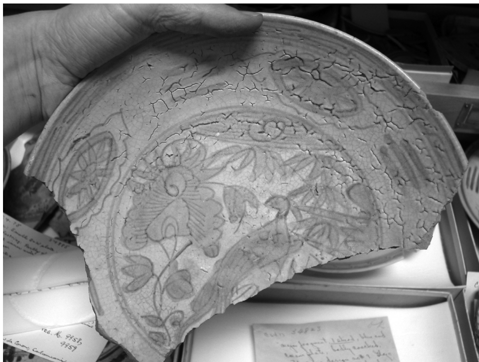
Fig. 10. Example of a Type V quality blue-and-white ware produced at Zhangzhou (B64-I3, photo no. 1789).

Any general quality grade based on technical sophistication is inevitably confronted by questions of aesthetics and taste of different cultures. Coarse porcelain is not universally regarded as less valuable than finer ones. For example, in Japan, a major importer of the Zhangzhou ceramics, the simplicity and perceived free spirit of these mass-produced goods had such an appeal that they were sometimes regarded as more desirable than fine porcelain. Upon examining the entire photo inventory of the blue-