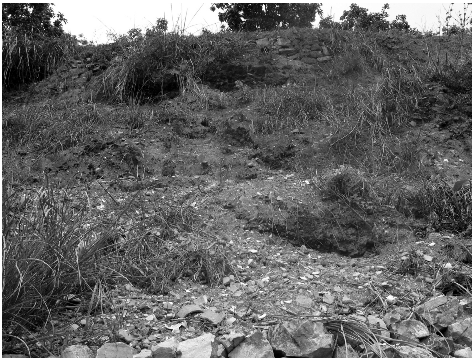
Fig. 5. Scatters of kiln wasters at Erlong site, Wuzhai Township, Pinghe County, Zhangzhou.

broad brushstrokes in depiction of floral patterns, mythical animals, birds, and human figures (Fig. 6).