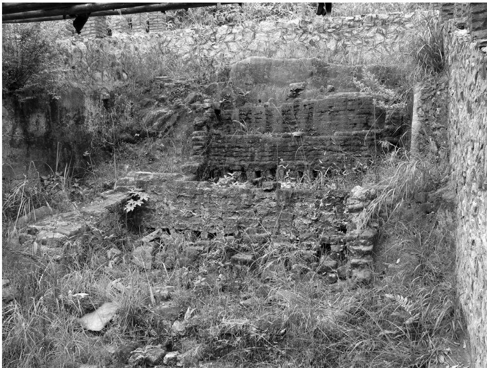
Fig. 3. One of the excavated kilns at Wuzhai Township, Pinghe County, Zhangzhou.