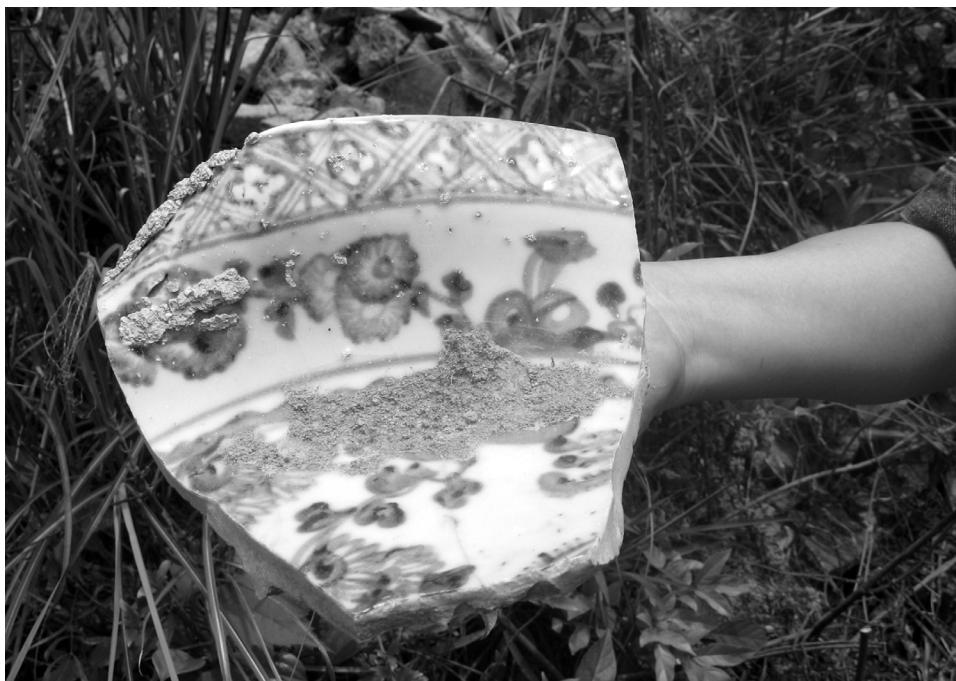
Fig. 6. Blue-and-white porcelain of “Simple Style” design at Erlong site, Pinghe County, Zhangzhou.