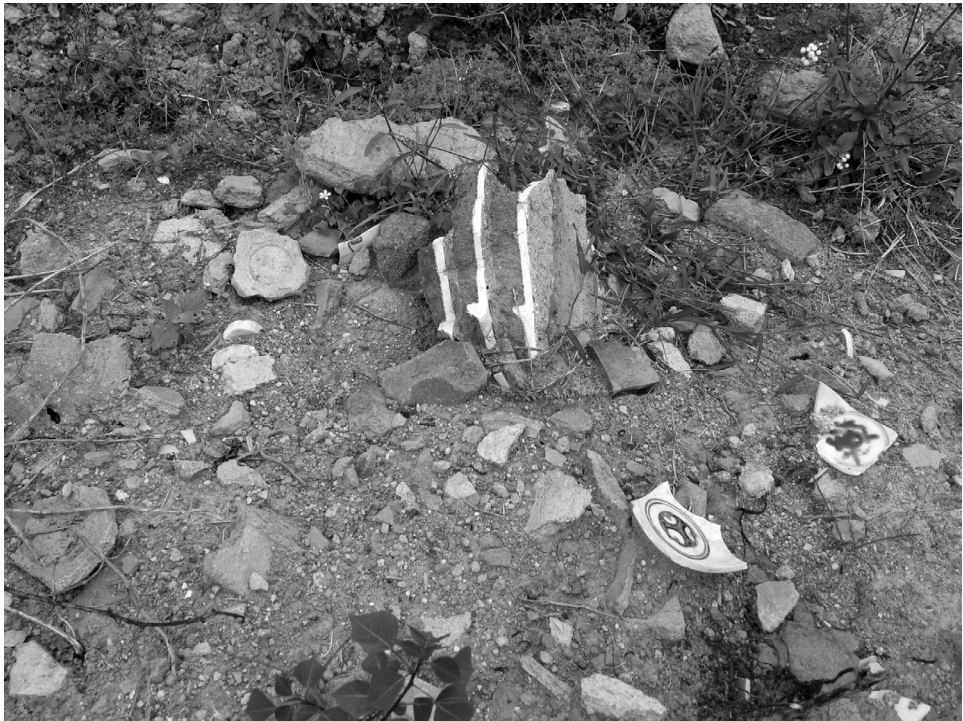
Fig. 8. Kiln wasters at the Erlong site, Pinghe County, showing dishes set in a thick layer of dark sand.