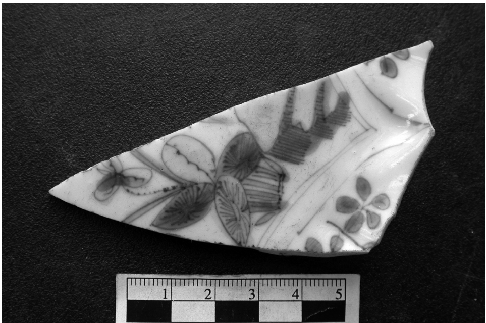
Fig. 9. Example of a Type 1 porcelain, produced at Jingdezhen (B15-5, UMMA 18457, photo no. 7894).