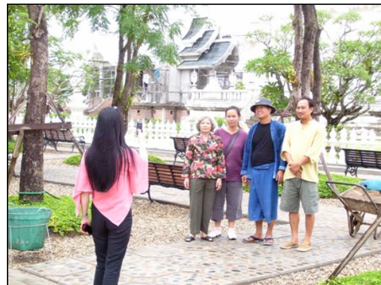
Figure 1: National artist ( sin ) Chalermchai Kositpipat (second from right) entertains fans of his artwork at his temple Wat Rong Khun in Chiang Rai.

In central Thailand, there is commonly only one artist ( sin ) creating the mural while several craftsmen ( chang kian ) work behind the scenes. The artist creates the scenes and works closely with the temple patrons, while the craftsmen creatively fill in the details of the murals. In northern Thailand, a local folk artist ( sa-la ) performs the role of both artist and craftsman. Despite his efforts, the Fine Arts Department in Bangkok never considers the sa-la 's work as art and he is seldom recognized as a regional specialist. The following essay seeks to better understand the art of mural