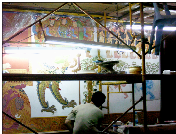
Figure 4: Tong paints on national artist Chakraphan Posayakrit's murals at Wat Tridosadepvoravihara in Banglamphu, Bangkok.

Posayakrit's murals: not only as an act of merit ( tham bun ) and to preserve history, but as a commissioned job as chang kian . For Tong, the definition of mural painting is not purely didactic, as Wray (1972: 16) suggests or religious as Boisselier (1976) claims. Instead, for the muralists Tong and Yoi, it is a way of life influenced by the world outside the walls of the ordination hall and articulated on the canvassed walls within. As Cate notes, during the past century "agencies of modernity," such as the development and growth of the Thai government's Fine Arts Department, the Por-chang School of Fine Arts and Silpakorn University, shaped the tradition of Thai mural painting and confined it to the discipline of art history (2003: 7). The study of Thai mural painting in the twentieth century defined Thai mural paintings as "Thai art", and thus became part of the national discourse on contemporary Thai identity (Cate 2003). However, Thai mural painting should be understood from alternative perspectives in addition to the traditional art history understanding