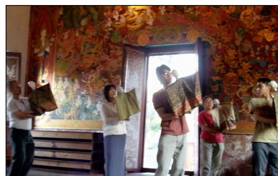
Figure 7: Bangkok policeman (far left) directs Lakorn Lek rehearsal at Wat Tri every Wednesday