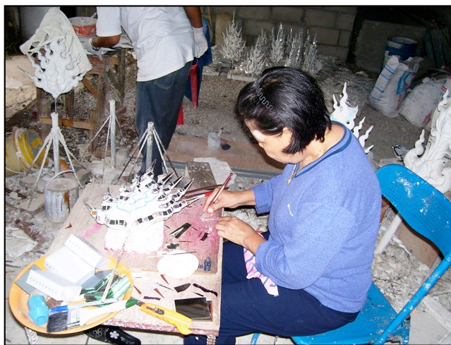
Figure 3: Local northern Thai craftsmen ( sa-la ) work behind the scenes at Wat Rong Khun for artist Chalermchai Kositpipat.

teacher. 4 In Kham Mueang the term was first used over 200 years ago when Burmese merchants began to trade their goods in the northern regions of what is today contemporary Thailand. The word sa-la is one example of many culturally loaded words in Thai society ex-