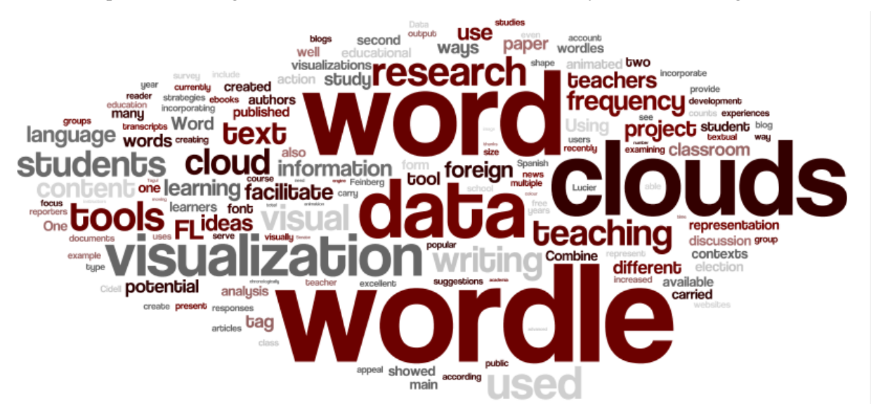
Figure 1. Example word cloud from Wordle.net (created by the authors).

Defined by Feinberg as a "toy," Wordle is used by many for its simplicity and its visually appealing results. Users simply need to copy text from any source and paste it into Wordle, which performs statistical analyses of the text and organizes it by word frequency. Users can then change the font, shape and color scheme of the resulting image, remove any unwanted words, and view the total word frequency counts in a separate chart. Figure 1 below shows a word cloud created by the authors using Wordle.