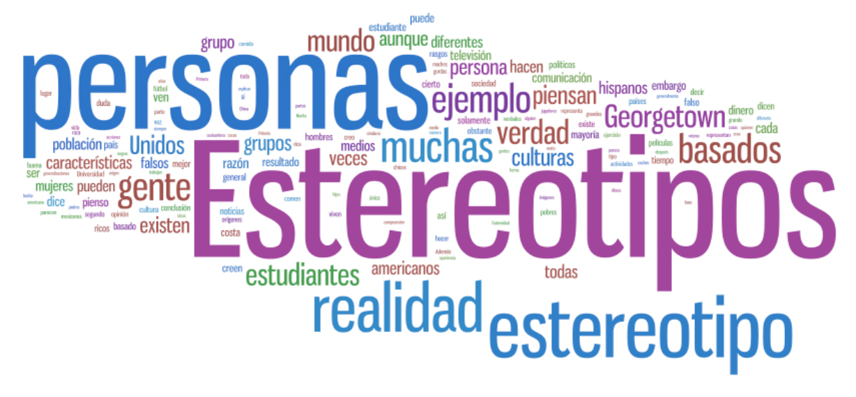
Figure 3. Students' wordle for the second draft of composition two.