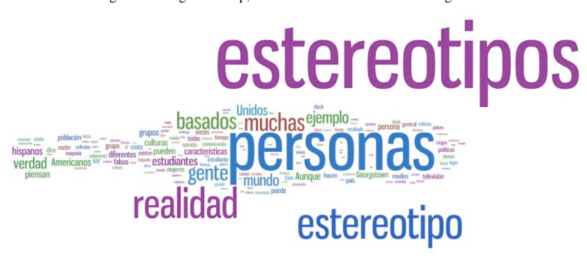
Figure 2. Students' first wordle for draft one of composition two.

For the second composition, students were asked to submit their first draft to the instructor electronically. Using Wordle, the instructor then created a single wordle based on all the students' compositions. During the next class meeting and writing workshop, the instructor showed the resulting wordle to the class.