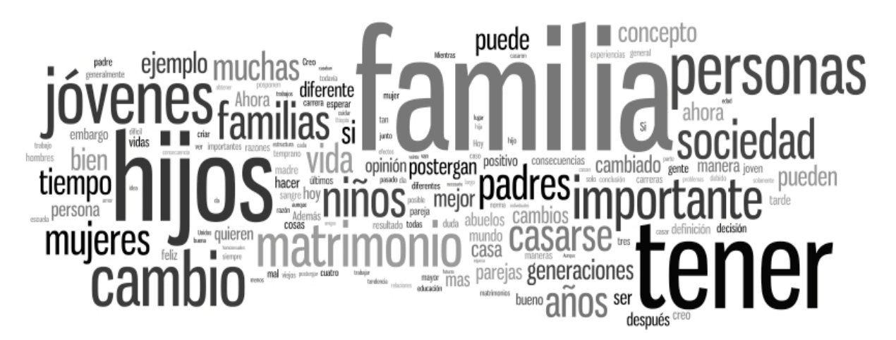
Figure 5. Students' wordle for final composition.

For example, the first wordle and word frequency count showed that students employed only the present and past tense; however, by the fourth composition, they were using the present, past, future, perfect tenses, and even the present subjunctive. Though the addition of these tenses and moods was a function of new grammar learned during the semester, the wordles helped to show how much students had learned and how much they could express in writing by the end of the semester. It is important to point out that the very mechanisms of their writing served as the focal points of their own class discussions about the writing process.