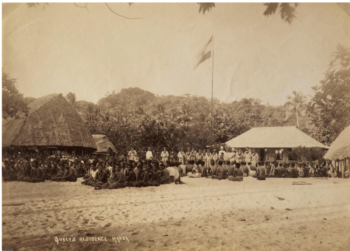
Figure 9: The 'Queen's Residence.' Notice the flag and the 'government house' (right of center). The government house was shaped like a Samoan fale but constructed of pālagi building materials. It also featured windows and doors.