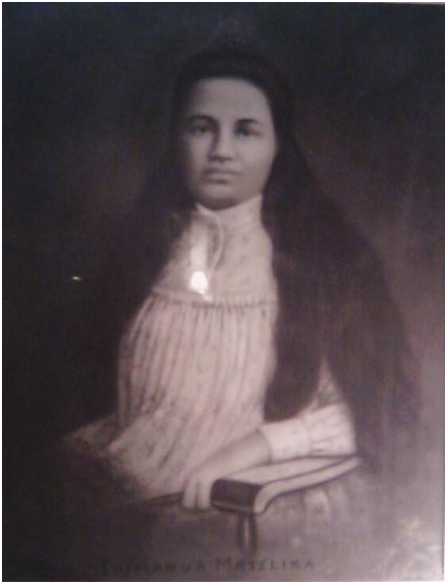
Figure 8: Tuimānuʻa Matelita Totoluafiliʻosāmoa, the gr. gr. granddaughter of Tuimānuʻa Moaʻatoa. She was the fourth and last female Tuimānuʻa.