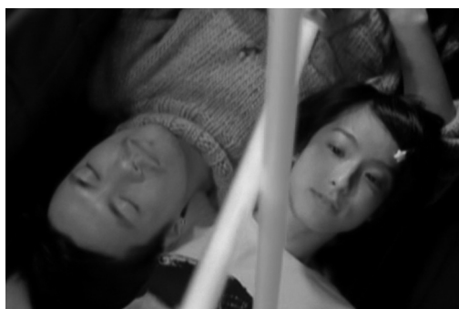
This year's favorites: among the early hits of Taiwan's 2012 box office year have been BLACK AND WHITE EPISODE 1: THE DAWN OF ASSAULT (top) and LOVE (above).

film from East Asia to be shortlisted in the best foreign-language film category, taking precedence over China's official submission, THE FLOWERS OF WAR by Zhang Yimou, coincidentally the most expensive film from mainland China.