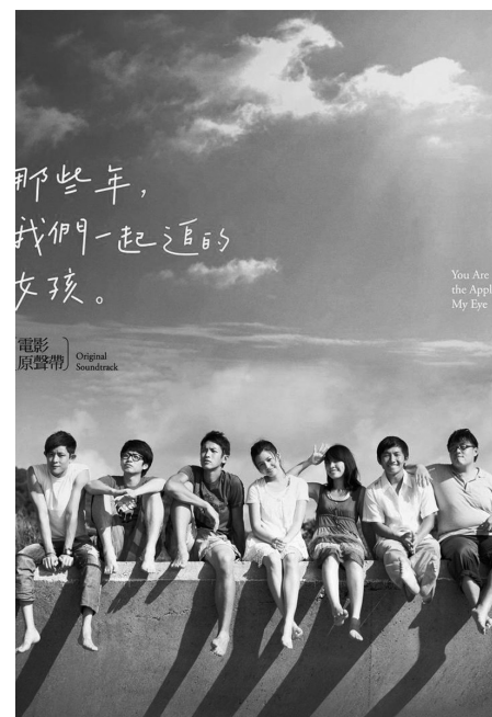
Taiwanese hits that went worldwide (from left): MONGA (2010); NIGHT MARKET HERO (2011); YOU ARE THE APPLE OF MY EYE (2011)

government hosted a party at the 2010 Tokyo International Film Festival, at which it promoted its impressive line-up, spearheaded by the star-studded MONGA delegation, informing the world that Taiwan's film industry was officially and irrepressibly back. The banners at this red carpet event proudly proclaimed "Taiwan Cinema Renaissance 2010: New Breeze of the Rising Generation."