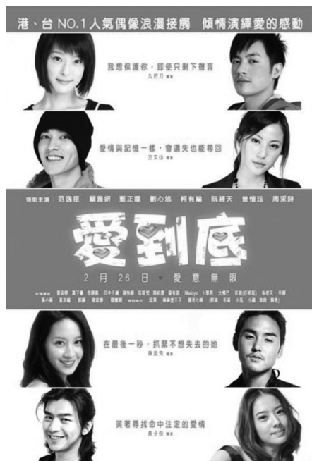
Hits both at home and afar (from left): WARRIORS OF THE RAINBOW: SEEDIQ BALE (2011); LOVE (2012)

Chinese-language film, surpassing the previous record of 7.85 million USD held by Stephen Chow's blockbuster comedy KUNG FU HUSTLE. In mainland China, it raked in 71 million CNY (11.3 million USD), knocking the 18.9 million CNY (3 million USD) gross of CAPE No. 7 out of its first place to become the best-selling Taiwanese film in China.