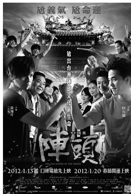
Movies that give new hope (from left): BLACK AND WHITE EPISODE 1: THE DAWN OF ASSAULT (2012); CAPE NO. 7 (2008); DIN TAO: LEADER OF THE PARADE (2012)

T he recent revival of Taiwanese cinema was set in motion in 2008 when Wei Te-sheng enthralled local audiences with his feature directorial debut CAPE NO. 7 . A romantic comedy about a dejected musician rediscovering passion, love and hope through the transformation of a rock band of misfit amateurs into an overnight concert sensation, CAPE NO. 7 was released in August to a rather moderate box office draw; however, significant word-of-mouth ensured that Taiwan's audiences promptly discovered and affectionately embraced this homemade sensation which nostalgically touched on the island's complex emotions toward its Japanese colonial past. The sleeper hit then became a must-see event across demographics. During its four-month theatrical run, CAPE NO. 7 raked in 530 million TWD (17.9 million USD) domestically, setting an all-time box office record for a Taiwanese film.