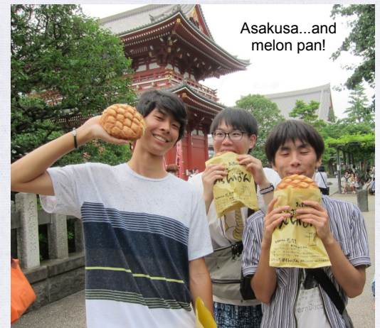
Asakusa...and melon pan!

I was able to gain some programming experience and was introduced to a new area of study. It was also a good experience to live on my own for the first time as I mentioned earlier. It may have helped me become more independent. One thing that I am more open to as a result of this exchange is graduate school. I wasn't planning on attending and am still not certain, but at least it is now more of a possibility.